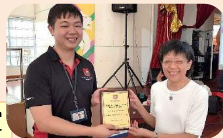
Congratulations on the successful completion of the 3-day Lockdown Drill workshop.

The morning ground exercise ended well with a debrief session done by the Security & Emergency Planning Office (SEMPO) trainer and a plaque was awarded to CPASS for the successful completion of the 3-day Lockdown Drill workshop.