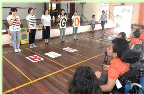
Action song – B. I. N. G. O.

On 20 September, our students from the Functional Junior programme were delighted to be involved in mobile Toy Library programme organized by Metropolitan Young Men's Christian Association (MYMCA). M.Y Toy Library team was a group of volunteers who used music and skit to engage our students in a series of songs and stories. They presented a series of nursery rhymes through movements and used different instruments such as recorder, keyboard and bells to engage our students in a sing-a-long session. A skit that re-enacted the story – The Great Big Turnip was also presented to our students during the event. This fun and engaging session had brought lots of laughter and joy to our students.