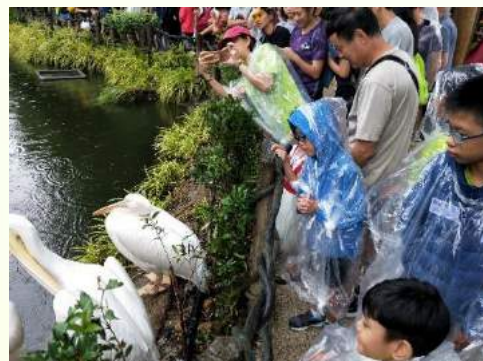
Getting up close with the Pelicans.

Thank you to all the volunteers who had assisted us!