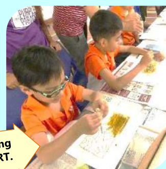
Exploring with ART.

The theme for the camp was 'Fun Time'. So all activities were organised with a fun element in them. The activities included water play at Splash@Kids Amaze, art, camp games and music & movement. Although it was the first time for most of the students to take part in an overnight camp, they had fun playing and mingling with the other campers. All of them also enjoyed sleeping in the tents.