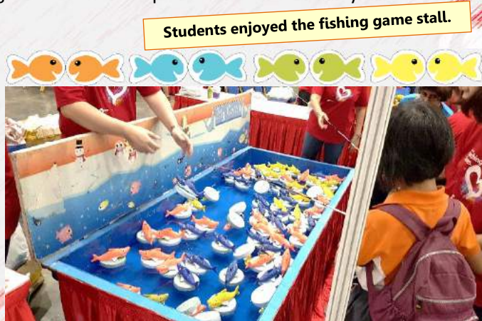
Students enjoyed the fishing game stall.