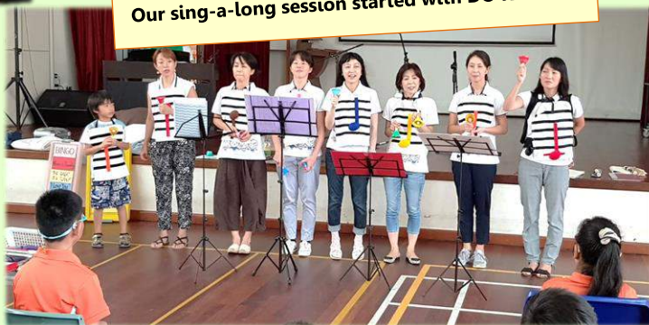
Our sing-a-long session started with DO RE MI.