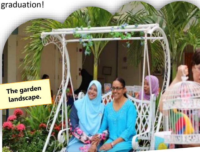
The garden landscape.

The graduates and their families left an everlasting memory in us, and we would like to wish them success in all their future endeavours. We will miss you graduates, you are never alone. Journey with me! Congratulations on your graduation!