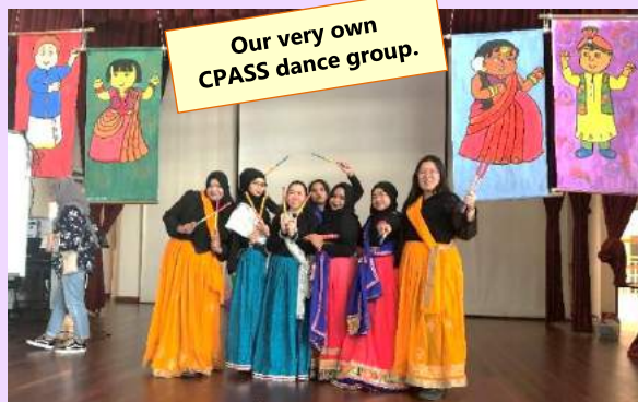
Our very own CPASS dance group.