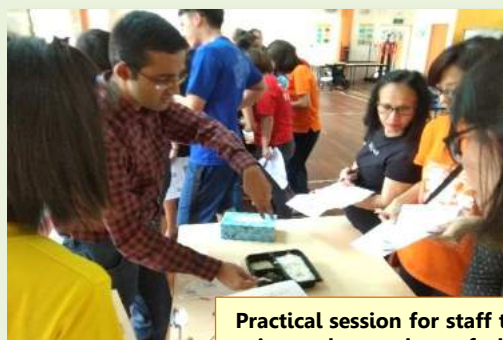
Practical session for staff to identify the different types of diet using cutlery such as a fork, a spoon and a pair of chopsticks.