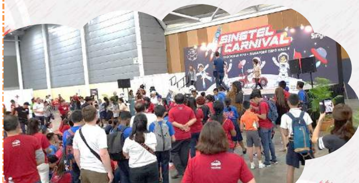
Students were dancing with the Singtel volunteers at the carnival.

On 10 October, the Singtel Carnival was held at Hall 3 of the Singapore Expo. The objective of the Singtel Carnival was to support engagement and interaction between their employees and the special needs community so as to build empathy, inclusion and advocacy with their employees. Students from all SPED schools as well as the Principals, teachers and caregivers were invited to participate in the event. The participants were given carnival coupons to exchange for sumptuous food items and a specially designed Tote bag to contain the various prizes. Together with the Singtel volunteers, the students enjoyed the different rides and games that were set up at the hall. There were about two train rides, three bouncy castles, one flying carpet ride and thirty Do-It-Yourself (DIY) games to engage the students. It was indeed a fun-filled and memorable day for both the Singtel staff and the special needs community.