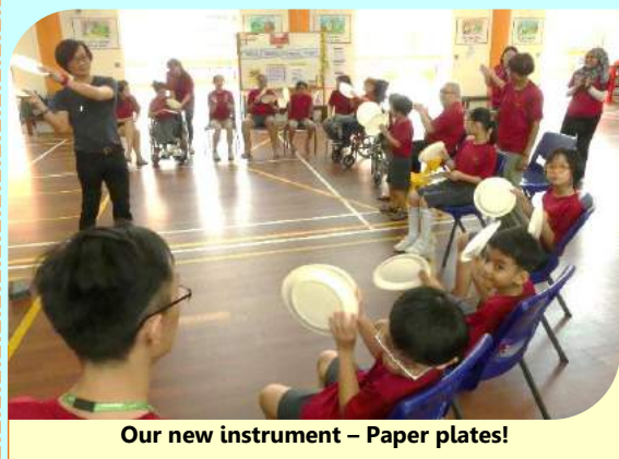
Our new instrument – Paper plates!