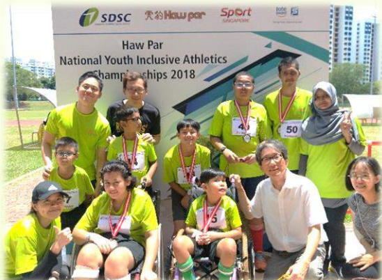
A group photograph with Mr Lim Swee Say after the prize presentation.

We were proud to say that our students had managed to secure 7 medals (3 gold, 4 silver) during the competition held at Bedok Stadium on 28 September. Despite the scorching heat of the sun, the students completed all the events without any complaints during our 6-hour stay. They had also displayed sportsmanship and resilience by giving their best in the competition. Well done, students!