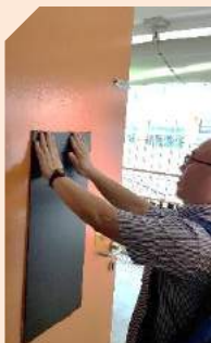
Mounting of the corrugated black-out board at the classroom door.