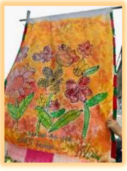
This flag depicts the vibrancy of the flora and fauna found in Singapore.