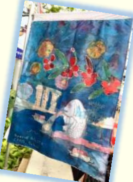
A sprig of orchids against a mirage of Singapore icons such as the Singapore Flyer, Merlion and Marina Bay Sands for this flag.

It was a proud moment for students of the CPASS Special Arts CCA when they visited the True Colours Festival on 22 March at the OCBC Square. After a few months of preparation and hard work beginning from the fourth quarter of 2017, they were able to see the fruits of their labour displayed prominently at the festival. Students from the Special Arts CCA designed four flags as part of an initiative by Very Special Arts Singapore