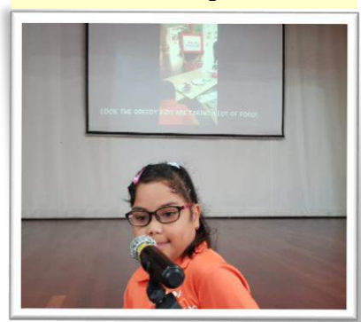
Great video performance by students of Class Eagle 1A, 2A and