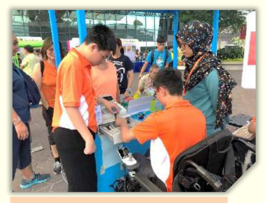
Cashiering at the carnival.