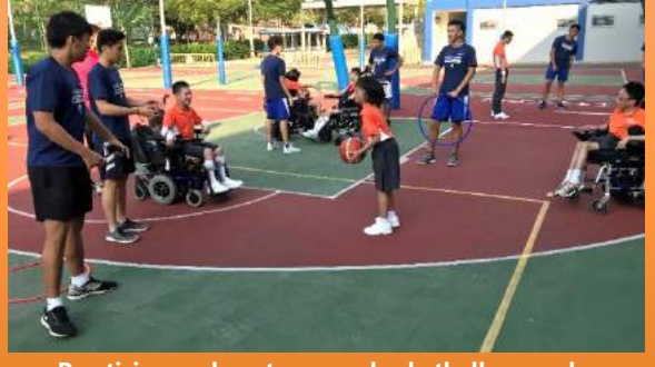
Practising on how to pass a basketball properly.

As part of CPASS and Meridian Junior College's Satellite Partnership, Classes Eagle 6A and Eagle 7A had been learning to play basketball with MJC's basketball team. MJC students were very forthcoming and likewise for our students as they were eager to learn to play basketball. This also marked the first time our students had their PE lesson in MJC. It was truly a fruitful experience for both schools and we look forward to future partnerships!