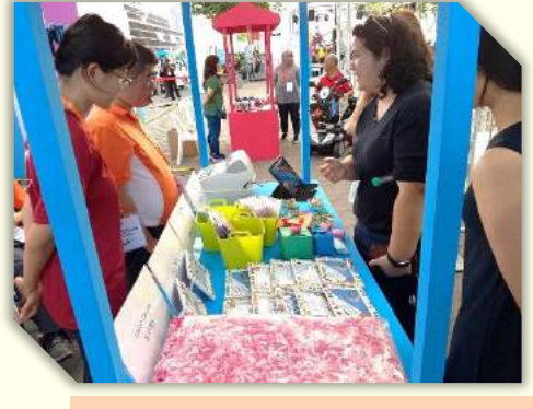
Selling crafts during the carnival.

During the carnival from 23 to 25 April, our students and staff also took turns to man the booth to sell the craftwork. It was an eye-opening experience for both students and staff to interact with so many people from all walks of life and disabilities at the carnival. Our students had learnt much from their interactions with the members of the public and it was a good platform to showcase their hard work and talents!