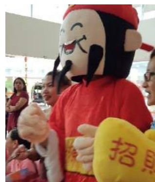
Arrival of the 'God of Fortune'.

Students and staff were excited over the Lion Dance.