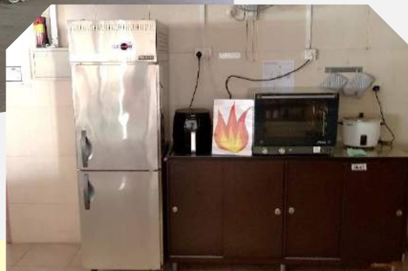
The location of fire was designated at the CPAS Cafe.