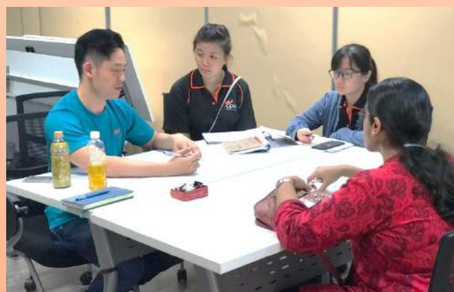
An IEP/ITP Meeting in process