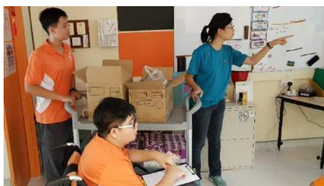
Staff & students were taking stocking of the number of meals needed for the class.