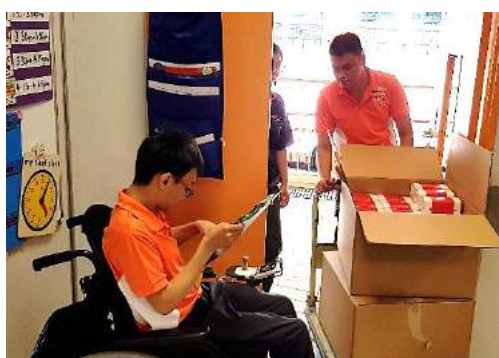
Students from the Functional Senior Programme assisted in the distribution of McDonald's Happy Meals.