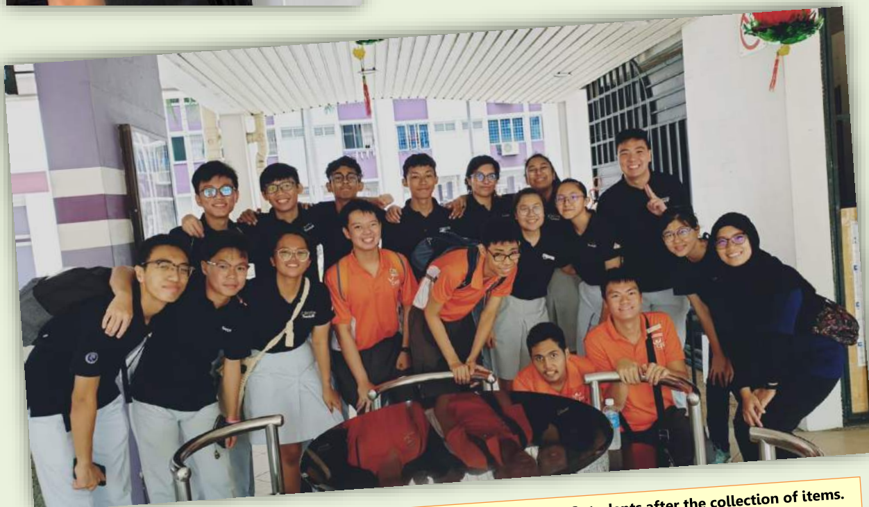
A group photograph with TMJC students after the collection of items.