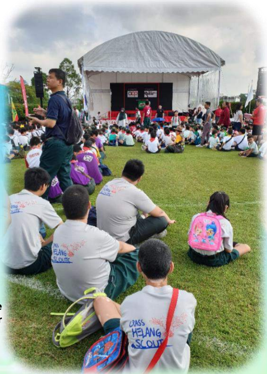
The CCA Scouts were waiting for the arrival of the Guest-of-Honour, Mr Chan Chun Sing, Minister for Trade and Industry at Bishan Stadium field.

The Scouts had a new experience meeting fellow Scouts and Cub Scouts through the morning programme while completing fun-filled activities at the various booths.