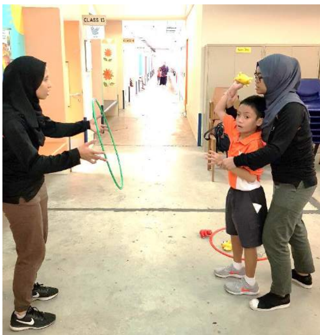
The student was requested to throw the bean bag into the hoop.