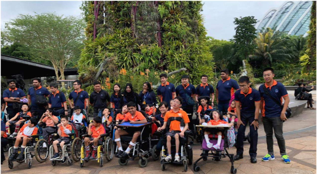
A group photograph with the SCDF volunteers.

On 28 February, CPASS was invited by Singapore Civil Defence Force (SCDF) to go on an outing to Gardens by The Bay. The staff from SCDF sponsored the admission tickets to the Flower and Cloud Domes. We were also served with snacks and transport was provided with the inclusion of 7 hydraulic buses and a 45 seater bus. A total of 7 classes attended this event: one class from the Functional Senior Programme and 6 classes from the High Support Senior and Junior Programmes. 20 volunteers from the SCDF were assigned to help in the event. The students and staff viewed the many varieties of flowers and plants. Many pictures were taken by class teachers, caregivers and SCDF photographers to mark this memorable day.