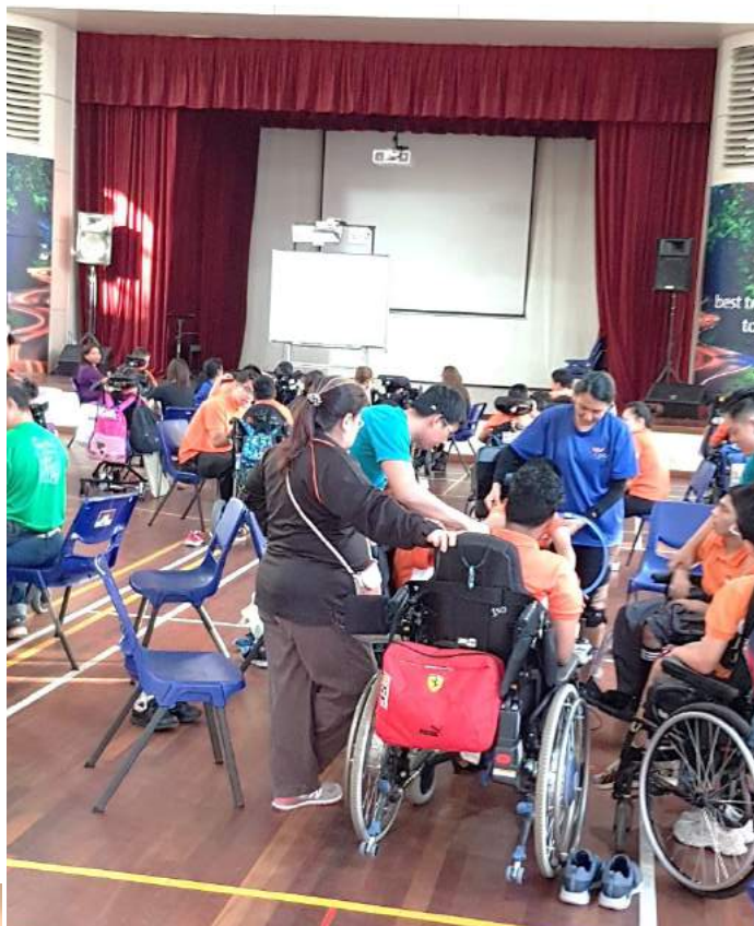
Students were doing group activities on passive range of motion for the upper limbs.