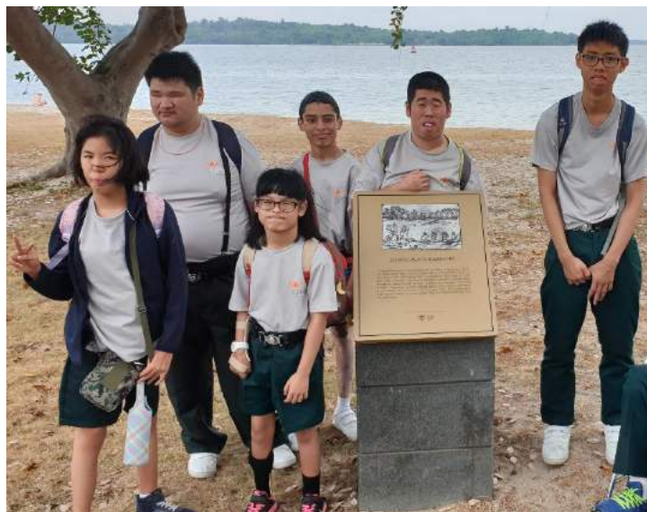
The CCA Scouts were standing by the memorial of the Sook Ching Massacre at Changi Beach Park

In commemoration of the Singapore Bicentennial year, Scouts units from the various schools in Singapore took part in a combined 200km trek to explore the different landmarks relating to the history of Singapore and Scouts. CPASS Helang Scouts Unit took part in the trek by exploring Changi Beach Park on 15 February, visiting the site where the Sook Ching Massacre took place on 20 February 1942. The Scouts enjoyed the short trek and their snack by the beach.