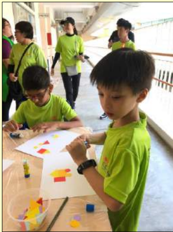
Let's form a collage of different shapes.

Everyone also enjoyed taking pictures of the artwork displayed.