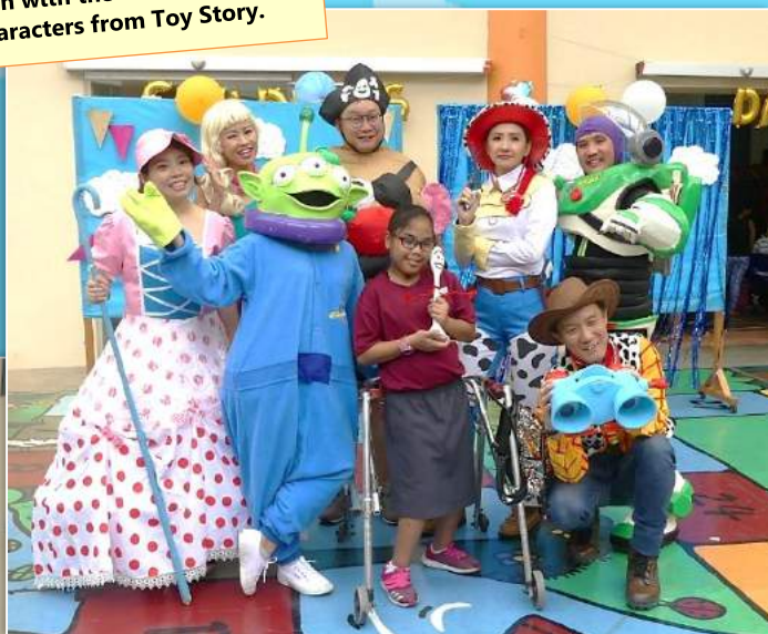
A photo-taking session with the volunteers who were dressed as characters from Toy Story.