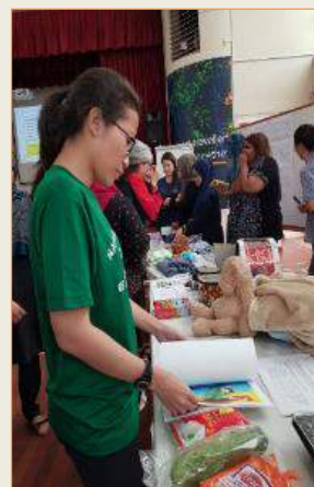
Teachers were looking through the thematic package resources.