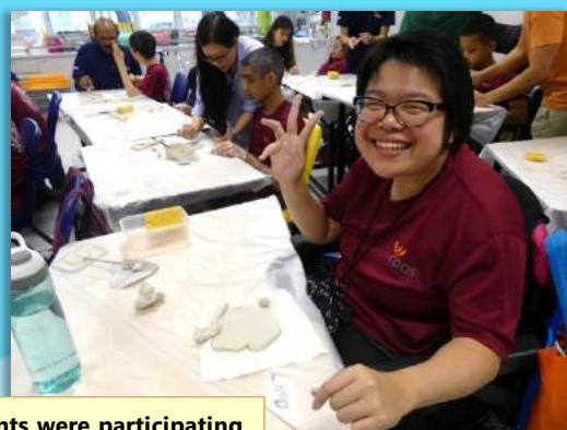
Students were participating in a pottery workshop.