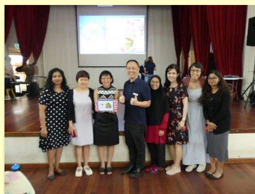
A Teachers' Day gift by the Social Work Department. 🌸