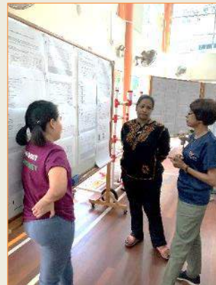
There was a sharing of lesson plans for the teachers in High Support Programme.

Overall, it was a meaningful and fruitful session.