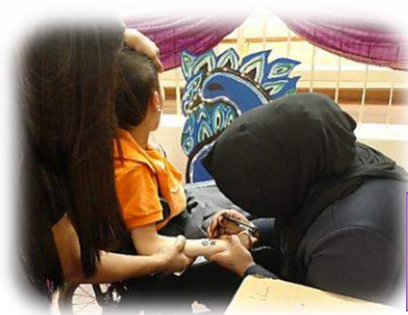
One of our students tried out the Henna painting on his arm.