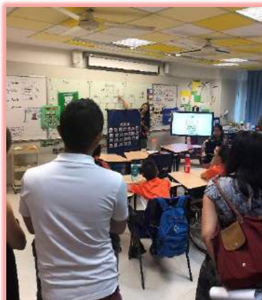
Parents were observing a Language Lesson conducted in Class Eagle 7B.