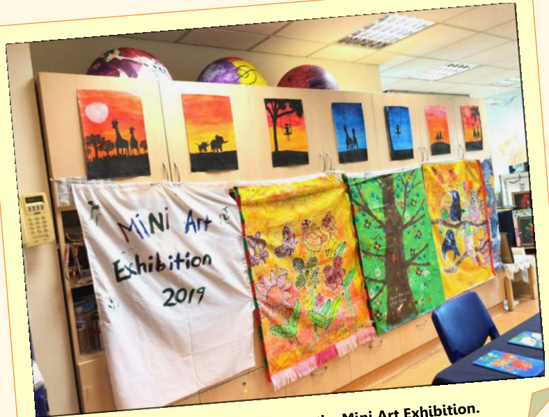
Some of the Artwork displayed at the Mini Art Exhibition.