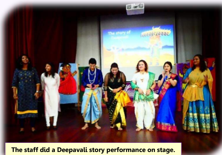
The staff did a Deepavali story performance on stage.