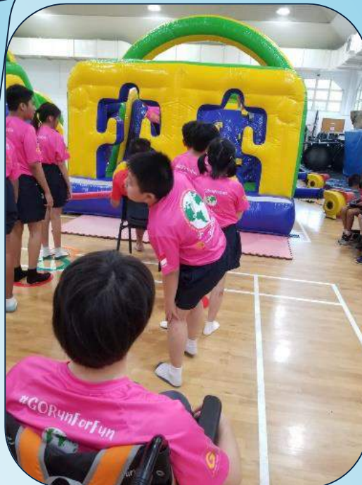
Students were lining up for the inflatable castle.