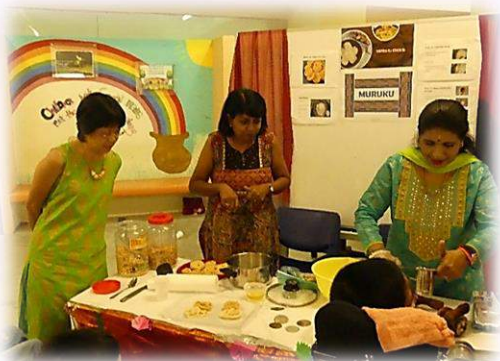
Staff and students were making and eating Murukku at the Murukku station.

Overall it was an enlightening and experiential celebration for our students.