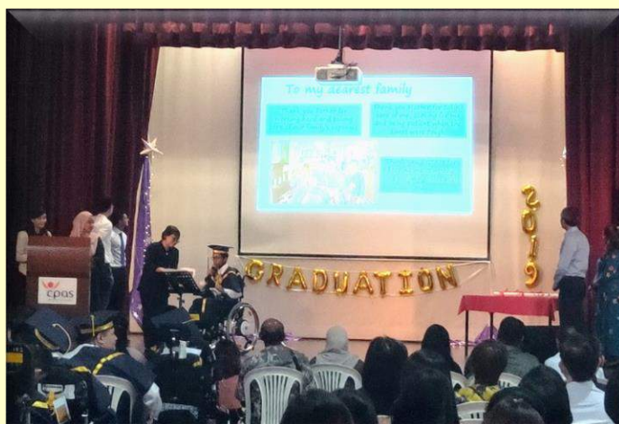
Our students were thanking their family in their heartfelt speech. ❤️