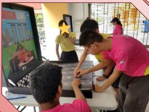
Our students were participating in one of the carnival games that was facilitated by the student prefects of Metta School.