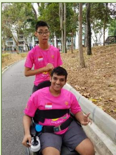
Our students were participating in the 800m run.

In sum, our students enjoyed themselves tremendously throughout the event. We look forward to participating in the Games Day at Metta School again in the future!