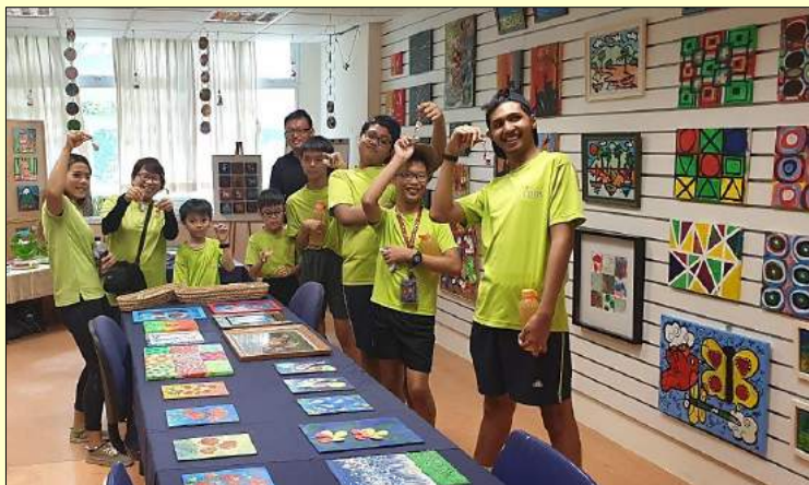
Students and teachers were enjoying the artwork.