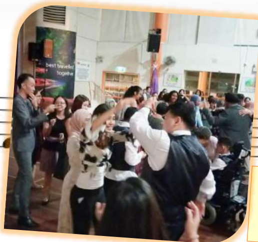
Everyone was enjoying the open dance floor and our CPASS band's live music! 🎵❤️😊