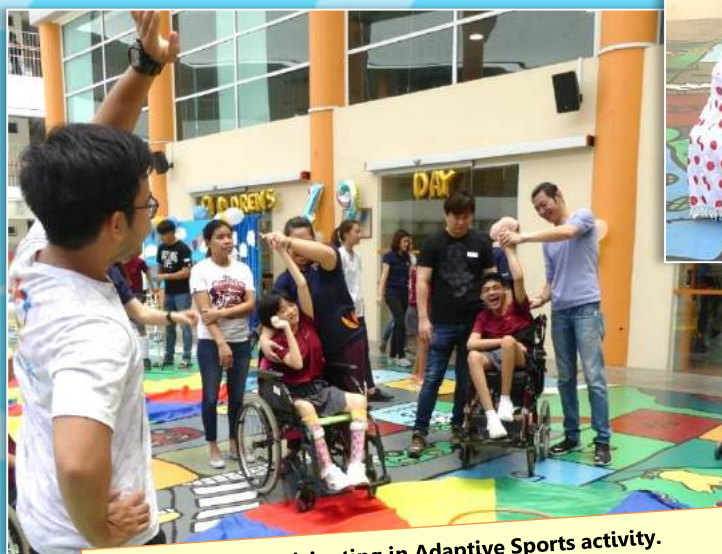
Students were participating in Adaptive Sports activity.