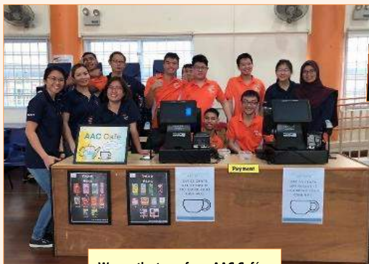
We are the team from AAC Café.

Overall, it was a fun and meaningful day for everyone!