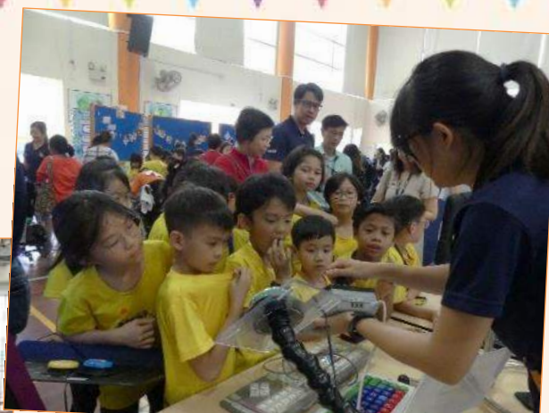
Students were amazed by the AT devices at the booth.