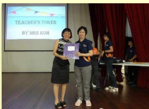
🎁 A token of appreciation for all staff. ♥

On the whole, everyone enjoyed the event for that day. It was also a day for all staff involved in educating our students to reflect on our commitment in special education.