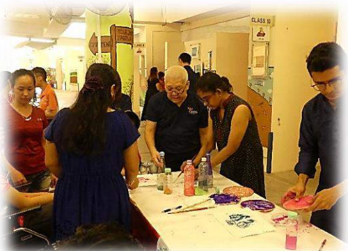
Students were making colourful Rangoli at the Rangoli station.