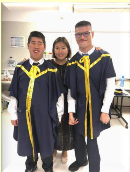
Our graduates were geared up and ready for the night! 🎉

All the hard work paid off and it was truly a heartwarming and enjoyable evening. We would like to thank all staff and sponsors, who helped with the event. Thank you to the parents for all your support over the years! We wish the graduands all the best towards their shining future!