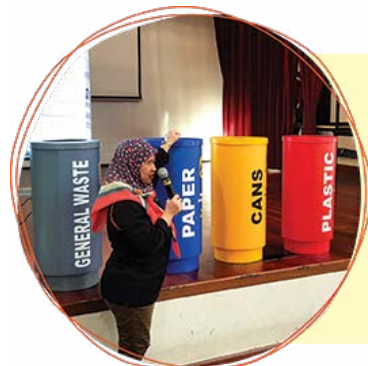
Introducing the range of recycling bins during assembly time

The standard EIPIIC Programme has been renamed EIPIIC@Centre