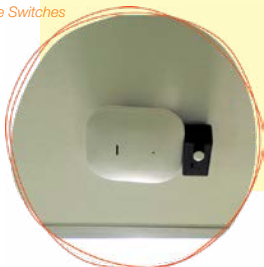
Sound Eye Devices in DAC Male Bathroom