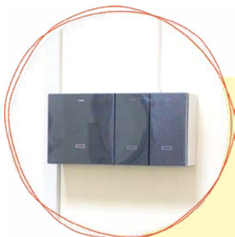
Smart Home Switches