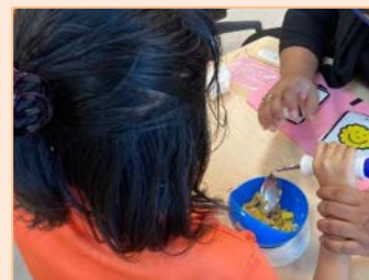
Final prototype of a utensil holder was tested in class.

During the trial phase, there was a lot of positive feedback provided by students, therapists and teachers. CPASS is very appreciative to NAMIC@SUTD for their help and support during this project. We look forward to continued collaboration to create more customised AT devices to benefit our students in future projects.