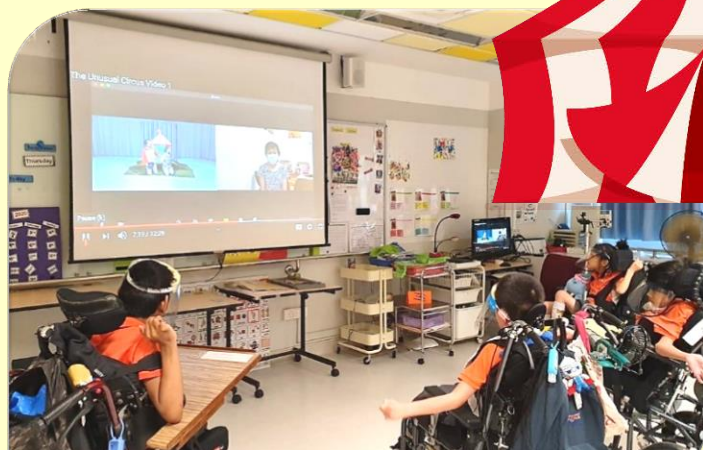
The students participated in "The Unusual Circus" digital workshop.

capture their memory on print at the photobooth. These budding photographers had just graduated memorable event for every CPASS students!