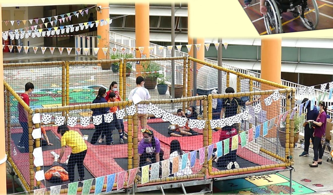
The 6-Bed Trampoline Station was one of the highlights for the event.