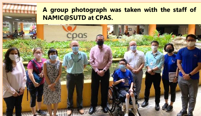
A group photograph was taken with the staff of NAMIC@SUTD at CPAS.

The second collaboration was with NUS School of Mechanical Engineering and School of Biomechanical Engineering (BME), working with student taking modules on engineering solutions and assistive technology. These undergraduates worked on various projects such as helping students to manoeuvre their manual wheelchair using knobs attached to the rim of the wheels and creating a cover for the motorised wheelchair so that the rider could travel in any inclement weather. We are also grateful to NUS undergraduates for helping to increase the level of independency in our students.