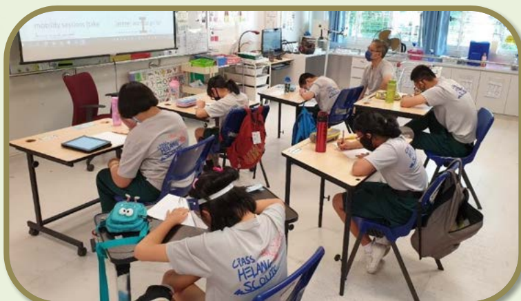
Scouts were preparing a draft of their reflection speech.