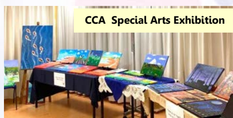
CCA Special Arts Exhibition