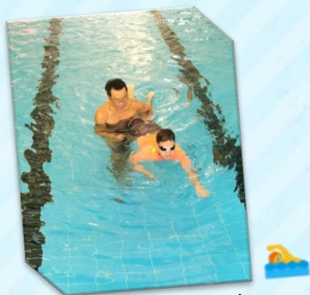
Focusing on swimming strokes.

The Swimming Coaches continued to work on the students' swimming strokes and also tried to incorporate some fun pool activities involving light medicine balls. Swimmers had shown their excitement in resuming their training in the pool and continued to demonstrate confidence and resilience in the water.