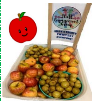
Apples and longans were the fruits distributed in the month for October.

To encourage healthy eating among the school staff, the SE team continued to promote the eating of fruits through the 'Fruits of the Month' activity. With the fruits being served to staff on the third week of each month, the team hoped that it would pave the way to encourage all staff to incorporate more fruits in their daily meals.