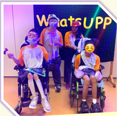
Team Facebook in action at one of the stations during Scavenger Hunt.