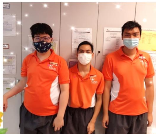
These three young gentlemen are ready to work upon graduation from School.

As these 3 students graduate into adulthood and employment, we wish them a bright future ahead!