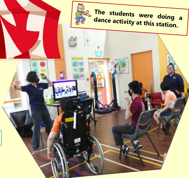
The students were doing a dance activity at this station.