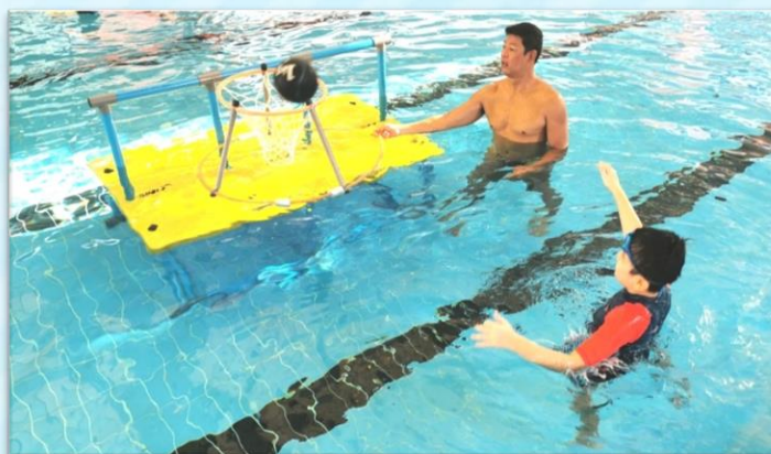
Fun water activities.