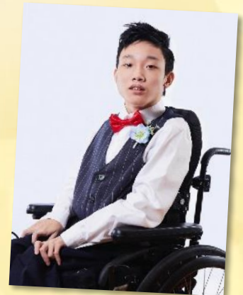
Graduates in their tailored prom gowns/suits.