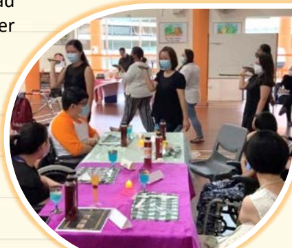
Our dedicated teachers worked as “waitresses” during the fine dining segment!

Although it was a day camp instead of a stayover event, students had fun throughout the camp leaving behind a lasting memory in them.