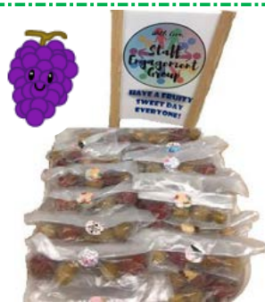
Packets of assorted fruits were distributed individually to staff during the Fruits of the Month.

In sum, everyone enjoyed themselves on that day. It was a day when students showed their appreciation in their own unique ways and for all staff to reflect and renew their commitment to give their best to the students.