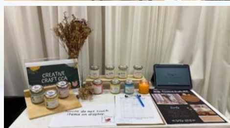
Sales of candles by CCA Creative Craft Club