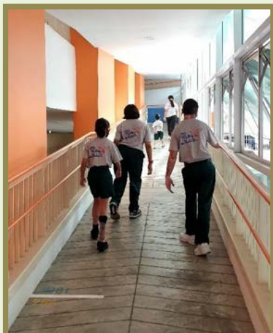
Scouts were walking up the ramp to level 4 of CPAS as part of their exercise activity during CCA session.

In light of the recent pandemic situation, the weekly CCA Scouts sessions were mostly focused on activities for the attainment of proficiency badges. The Scouts also prepared short speeches and PowerPoint slides on their reflection for the year 2020 which they shared with the unit during the last CCA session of the year. The unit also continued with the physical training that started in Term 2 after every Friday assembly. The Scouts had improved their walking endurance and could even do some static exercises independently without prompts. The Scouts are looking forward to attaining more badges next year and hoping to go for outings and scouting activities as well.