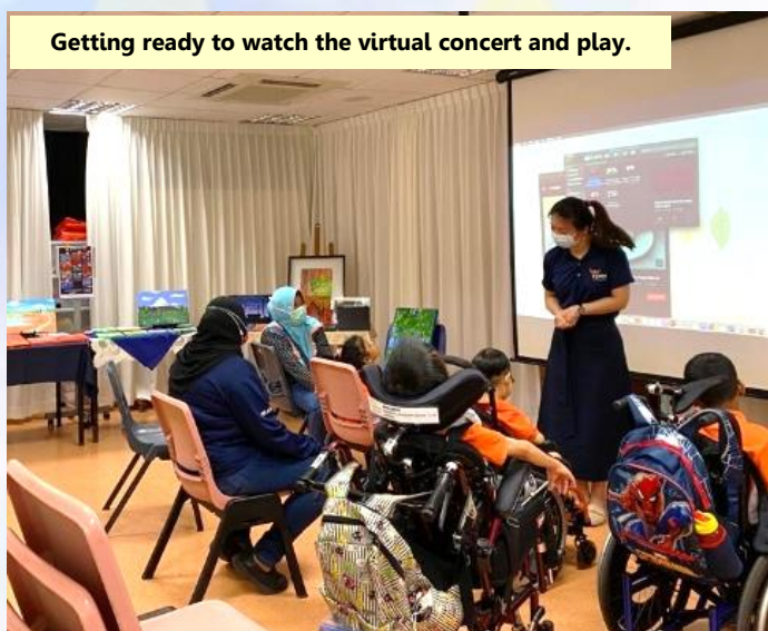
Getting ready to watch the virtual concert and play.

From 9 to 12 November, four CCA groups namely the Creative Craft Club, Multi-Sensory Drama Club, Special Arts and Performing Arts came together to put up an end-of-year event to showcase the students' work amongst these four CCA groups. There was a mini art exhibition put up by CCA Special Arts which was accompanied by a screening of a virtual concert and play put up by CCAs Performing Arts and Multi-Sensory Drama Club respectively. The CCA Creative Craft Club also showcased their scented candles which were handmade by the students. The event was held for a week in the Music Room and all the classes took turns to visit this showcase. It was indeed a creative and visual arts-filled week for the School and the students enjoyed this experience.