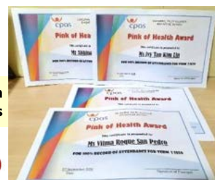
Termly Pink of Health Award certificates