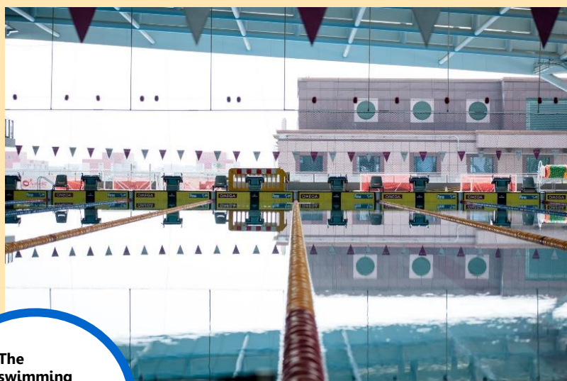
The swimming pool at level 6 in Our Tampines Hub.

Well done Siti Hawa and Jia Jun! We are very proud of you! ❤️❤️