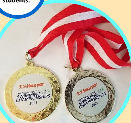
Medals received by the students.