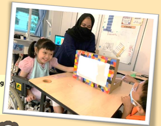
Students playing the shadow puppets with their teacher.