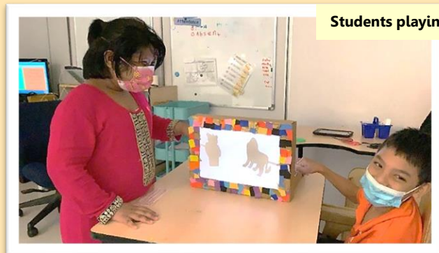
Students playing together.

The day continued with the students learning to make their own Wayang Kulit Shadow Puppet stage and puppets. All students and teachers enjoyed themselves thoroughly. The fun-filled day ended on a high note when all students were given a mini Anklung as a souvenir to remember the memorable day.