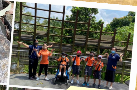
Group photo to remember the exciting day.