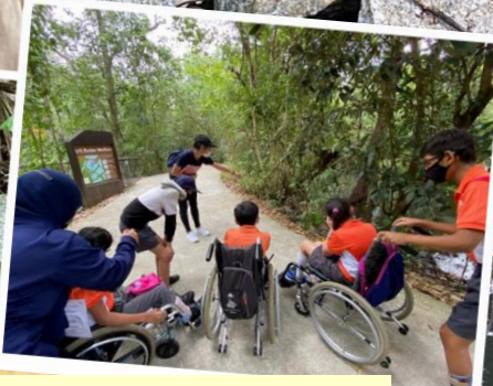
Look! A reptile crawling under the leaves.