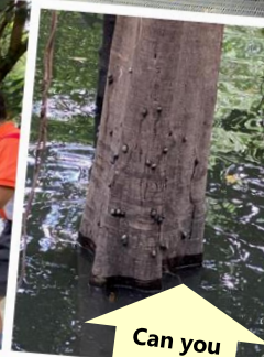
Can you spot the climbing crabs?"