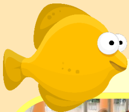
Catch of the Day

From students to teachers to volunteers, everyone enjoyed themselves thoroughly, playing games and interacting with one another while observing safe social distancing. Everybody had a whale of a time, yet silently and secretly, in all our hearts – let there be Sports Day 2022!