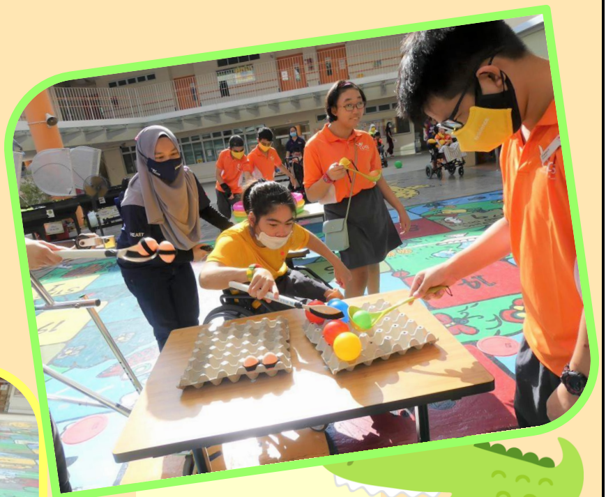
Hungry Crocodiles Game