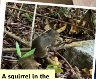
A squirrel in the wetland reserve.