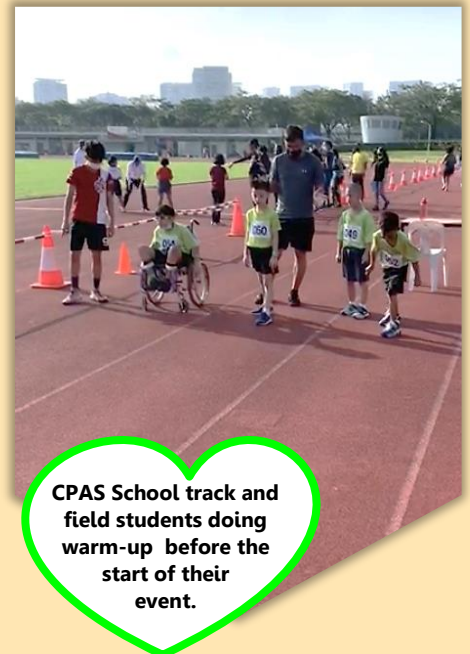
CPAS School track and field students doing warm-up before the start of their event.