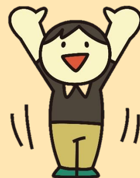
Functional senior students exercising in a group and following the instructions from PT.