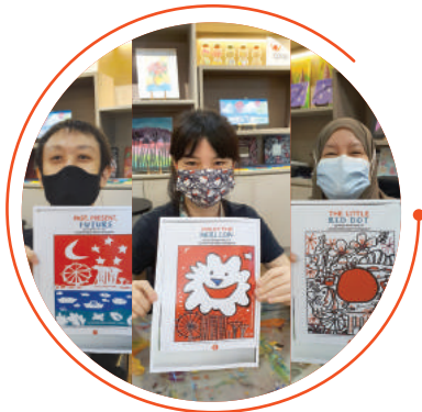
GROW Artists (From left to right):