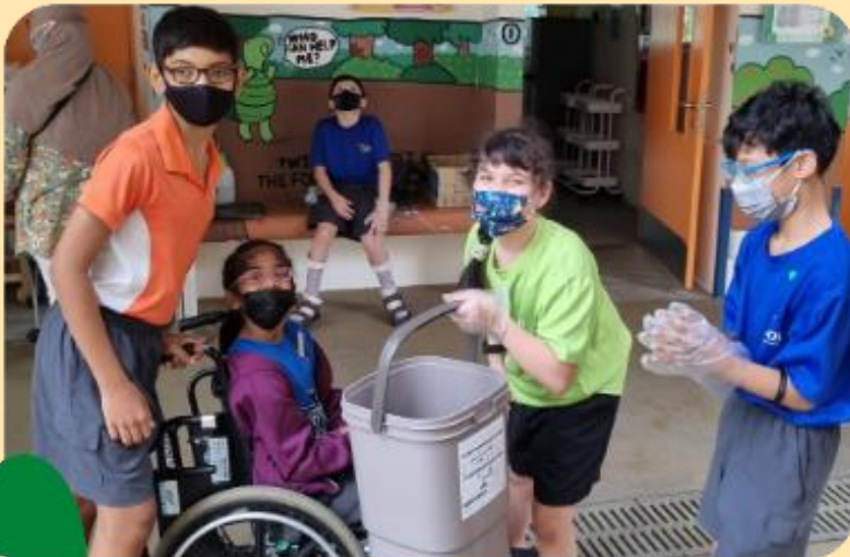
Students helping to line the Bokashi bin with banana peels.