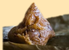
A simple meal of glutinous rice wrapped in bamboo leaves.