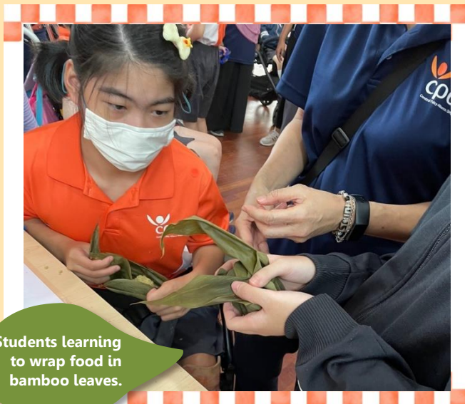
Students learning to wrap food in bamboo leaves.