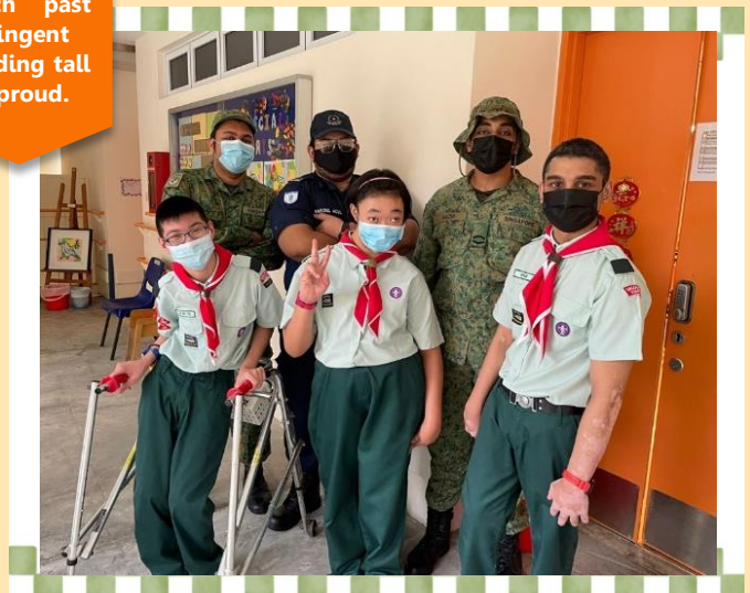
March past contingent standing tall and proud.

Three interactive booths were set up in the hall where students experienced using bamboo leaves to wrap cooked glutinous rice. They also tried their hands at packing kacang putih (assorted nuts) in a paper cone. Students had fun taking pictures at the photobooth dressed up in various frontline workers' uniforms. Students had a fun time encountering different experiences at the variety of booths set up by the NE committee. Learning new knowledge and experiencing different things is a way of building resilience, and our students did that. Together We Keep Singapore Strong!