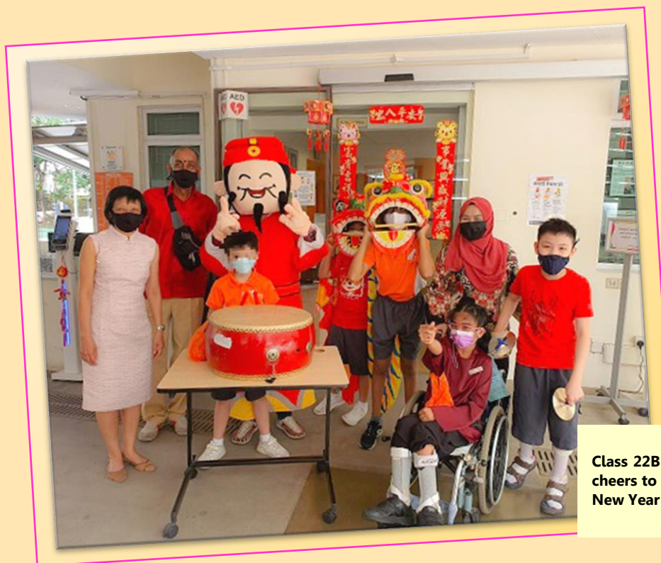
Class 22B group effort brought cheers to others during Chinese New Year celebration.