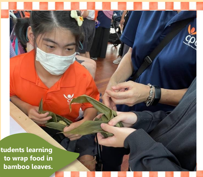
Students learning to wrap food in bamboo leaves.