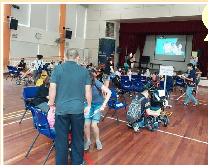
Students watching cartoon to keep them occupied after their vaccination.

The team of doctors, nurses, and staff from MOH conducted the vaccination exercise smoothly as they were already familiar with CPASS staff and students. The exercise began at 8am and completed by 3pm. The School Management team, Administrative and IT staff provided support for the exercise.