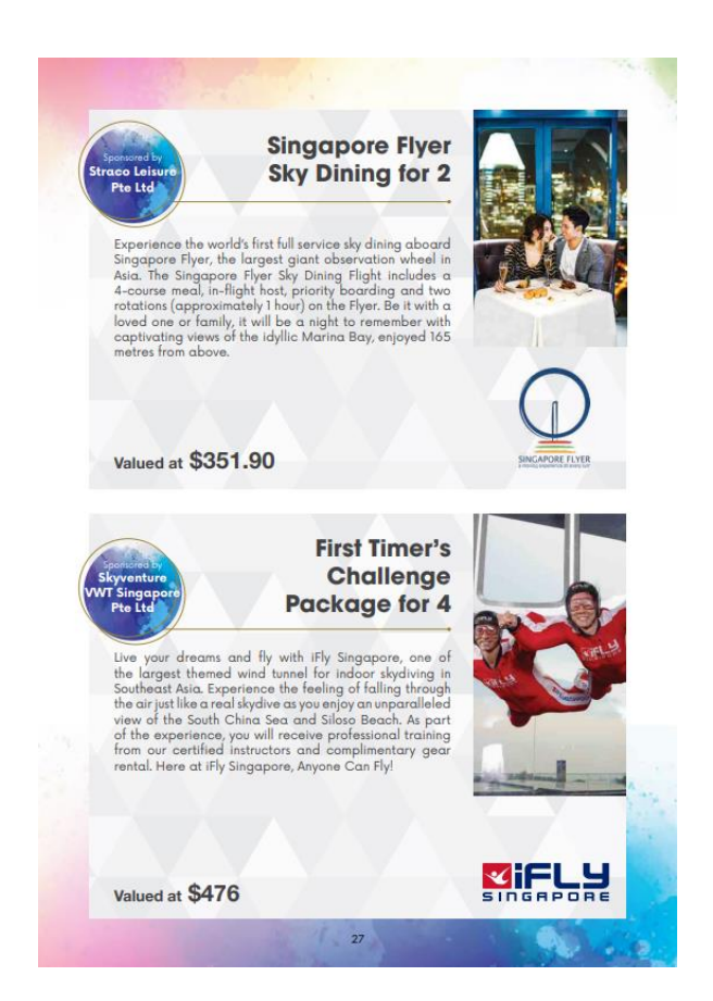
Sample of 2019 Charity Dinner Raffle Draw sponsor page