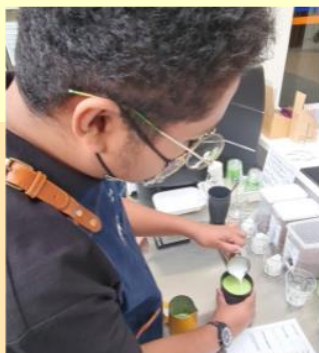
Preparing coffee at Foreword Coffee