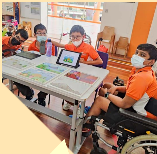
Students from Eagle 9A managed their booth to display framed artwork made by their classmates.