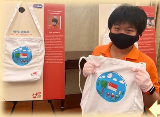
Design printed on the NDP tote bag

In the beginning of this year, SG Enable invited all the Social Service Agencies (SSA) in Singapore to participate in the 2022 National Day Parade tote bag design competition, and CPASS was one of them. The theme for the competition was “Stronger Together, Majulah!”