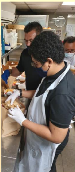
Packing breakfast at PanPac