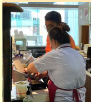
Restocking the pantry at The Food Platelets at the Blood Bank