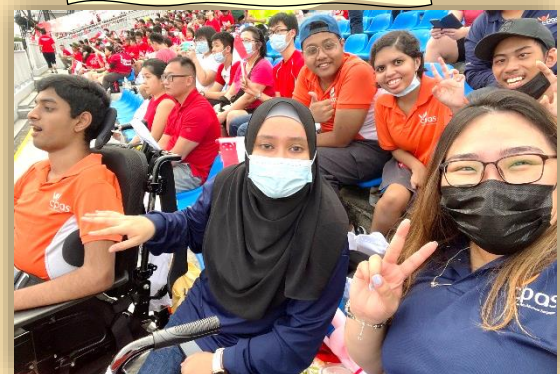
Teachers and students enjoying the NE Show performance.