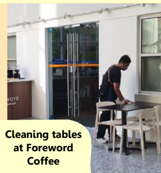
Cleaning tables at Foreword Coffee