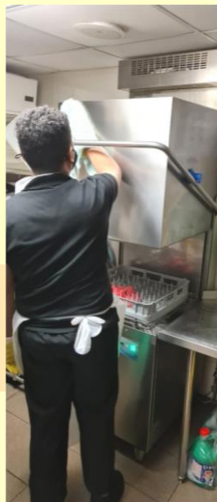
Cleaning the dish washing machine at Pan Pac