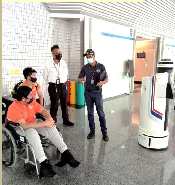
🤖 Demonstration on using robot to patrol the main lobby of the facility

It was a fruitful and meaning experience for all the students.