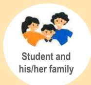
Student and his/her family