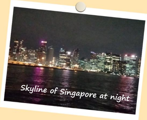
Skyline of Singapore at night