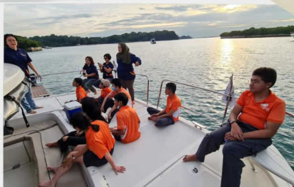
Everyone relaxing at the sight of a beautiful sunset