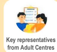
Key representatives from Adult Centres