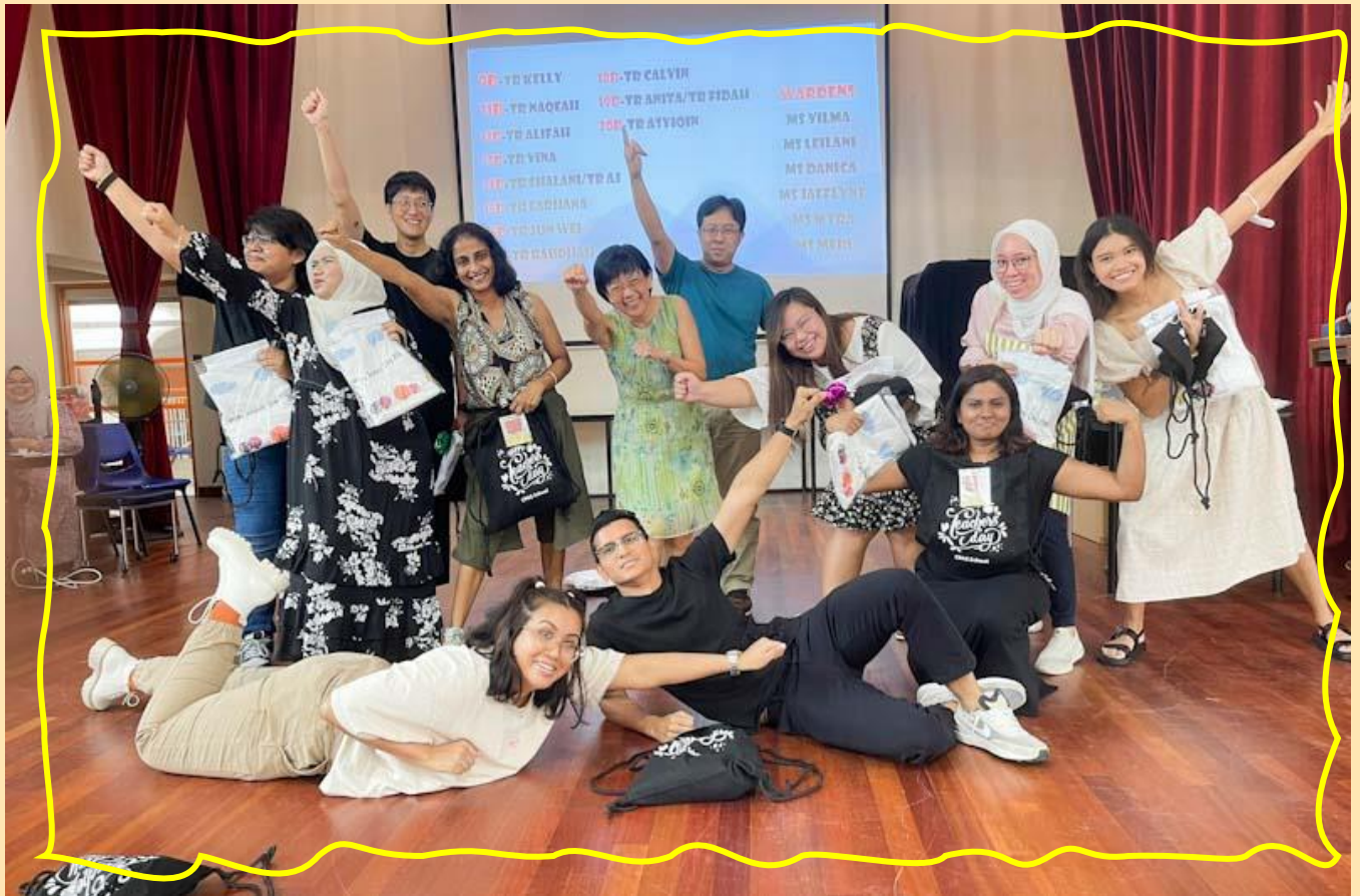
CPASS is not without our own superheroes!