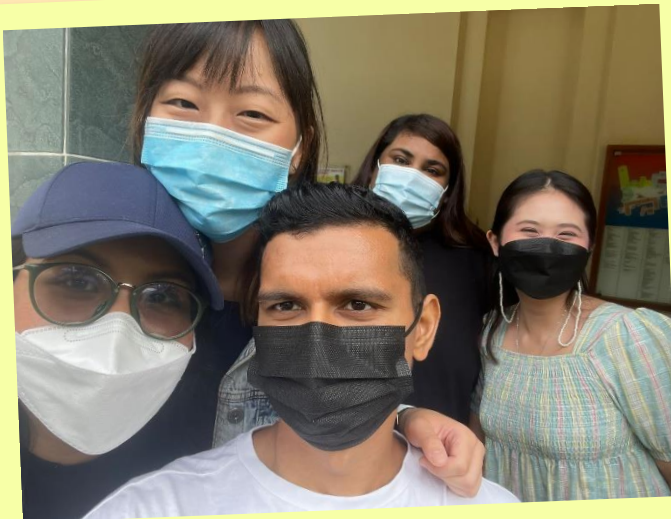
Joyful faces from the 5 of us after the completion of our first test together in DISE!

In conclusion, as we all look forward to graduating from NIE as trained SPED teachers, we would like to express our thanks to CPASS, for providing this opportunity to achieve new milestones as SPED teachers! Additionally, we wish to send our appreciation CPASS staff who have assisted us in so many ways to make our DISE journey so fruitful and poignant.