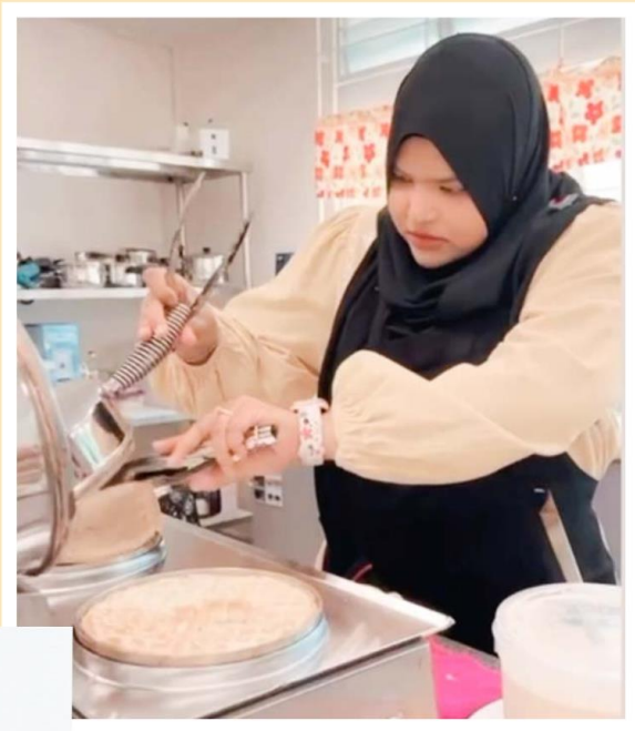
Hot, hot waffles by our lovely teacher aides!