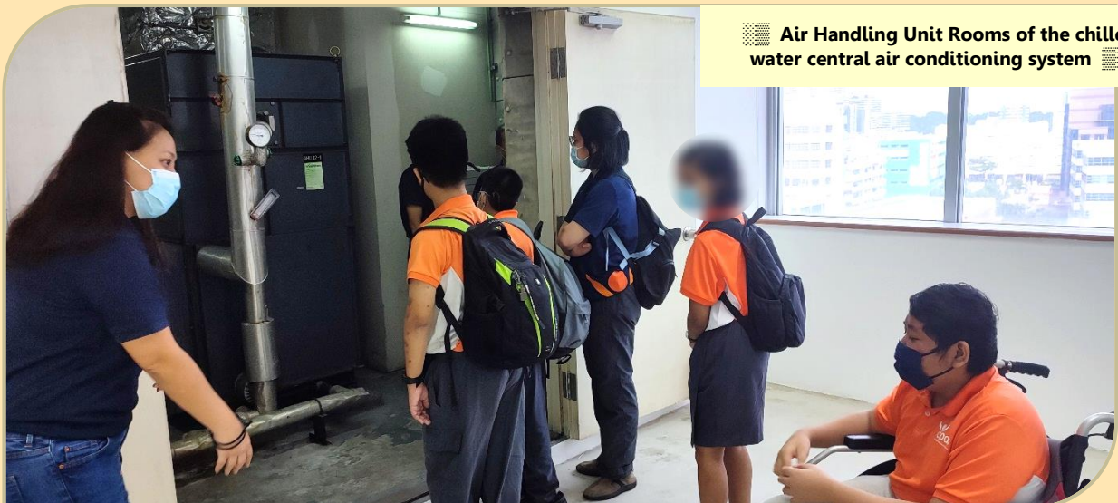
🏠 Air Handling Unit Rooms of the chilled water central air conditioning system 🏠