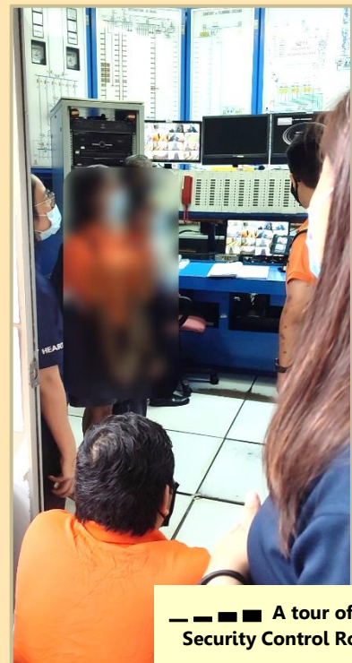
— — — — A tour of the Security Control Room