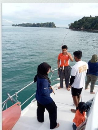
Trying our hand at fishing