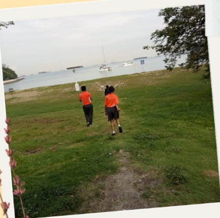
Leisurely walk around Lazarus Island