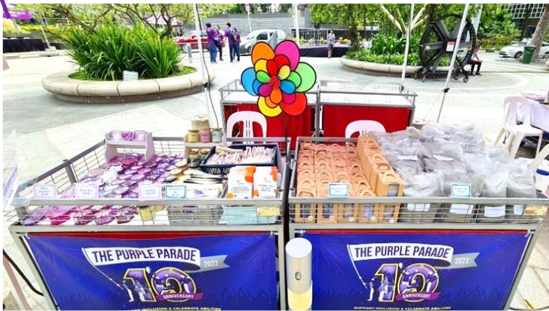
The CPASS booth at the Purple Parade Carnival 2022

Student volunteers and teachers manned the booth at the outdoor carnival. Students shared that they were slightly nervous about manning the booth as it was the first time that they had to meet the public in a face-to-face sale as compared to sales events done in school. In the end, they felt that it was an enriching experience as they gain confidence in interacting with the public. They were able to practice the steps they had learnt in school and completed the sale smoothly under the guidance of the teachers present. Response for the sale of products was good and after the six-hour event, all the items were sold out. It was a satisfying result for the arduous work put in by our students and teachers for The Purple Parade