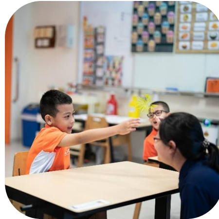
Special Education (SPED) School For children aged 7 to 18 years old