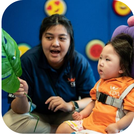
Early Intervention Programme for Infants and Children (EIPIC) For children below 6 years old