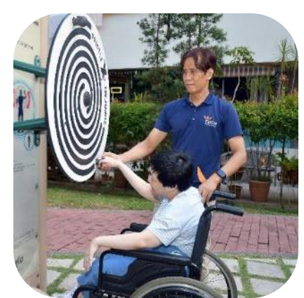
Home Management Programme