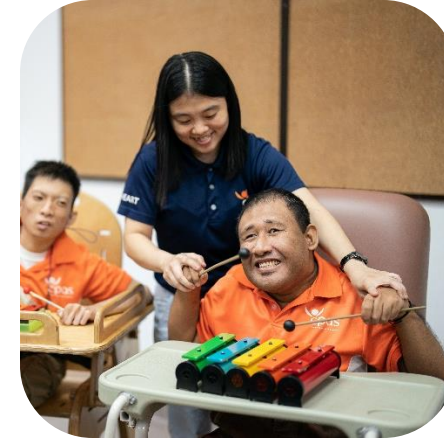
Adult Services (GROW / DAC) For adults aged 18 years old & above