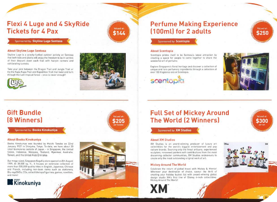
Sample of 2022 Charity Dinner Raffle Draw sponsor pages

Listed as Raffle Draw Sponsor on sponsor page