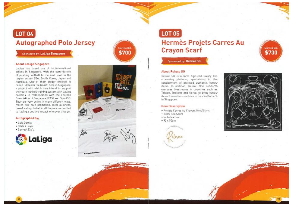
Sample of 2022 Charity Dinner Silent Auction pages

Listed as Silent Auction Sponsor on sponsor page