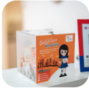
Direct Donations and Online Fundraising