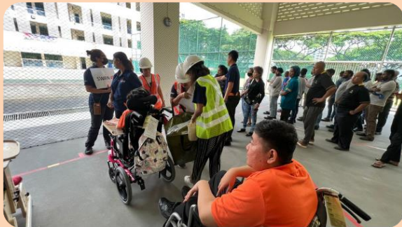
Students, staff, parents, volunteers and visitors assembling at the Assembly Area