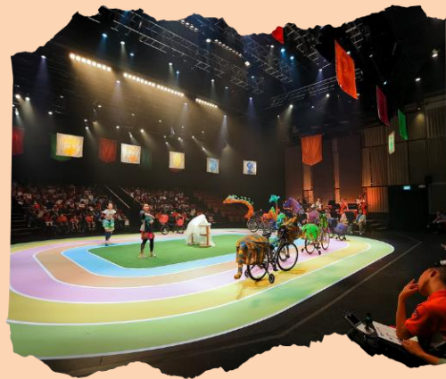
A scene taken from the musical when the animals were in the race