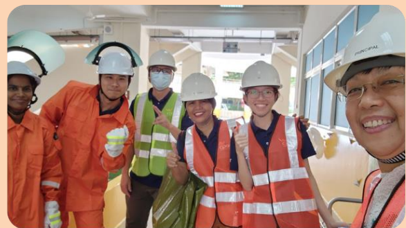
Our Emergency Response Team getting ready to respond to the emergency situation

The success of this fire drill highlights the importance of preparedness and reinforces the value of regular safety exercises. The fire drill has proven to be an exceptionally valuable learning experience for everyone involved. At CPASS (West), the safety of our students, staff, and everyone remains our utmost priority, and drills like these are essential in equipping us with the knowledge and skills necessary to confidently handled emergencies. Once again, we express our gratitude for everyone's active participation and cooperation during the drill.