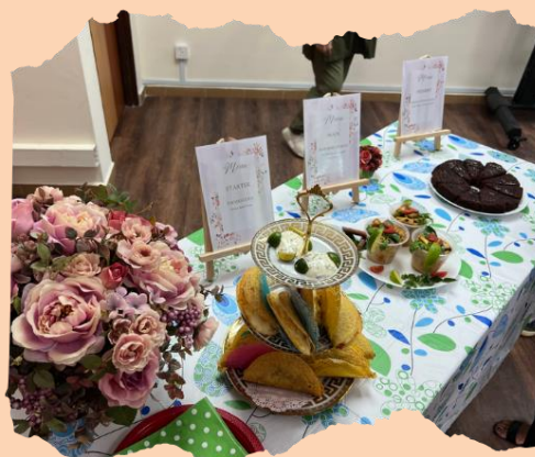
The final dishes with the deco set-up

Everyone was a winner in this Cookout. What we all brought home was the camaraderie, team spirit and getting to know each other better. CPASS (West) is a true family and the dynamic and the strength of the staff will hold true for years to come.