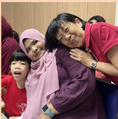
Staff and students enjoying the National Day celebrations