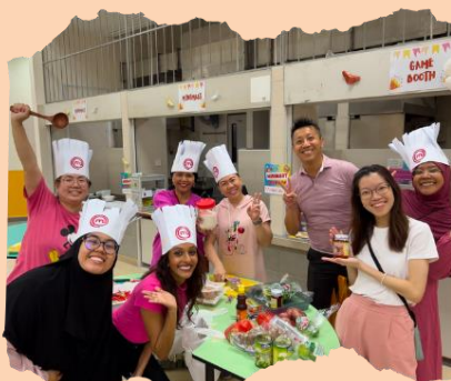
The Mains Team