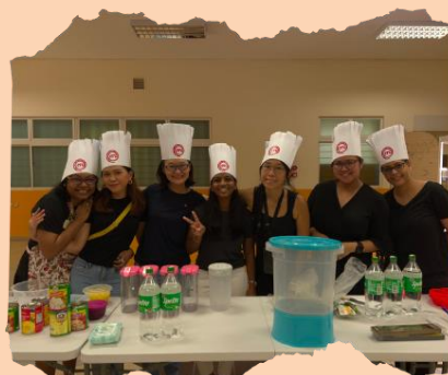
The Dessert Team

The staff were split into 4 groups: "Entrée", "Mains", "Dessert" and "Deco". The organizing duo divided the team with care, connecting old and new staff. Having a good mix of racial diversity gave the organizing duo the chance to come up with the groupings with ease.