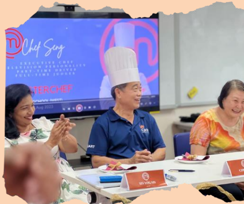
The esteemed judges