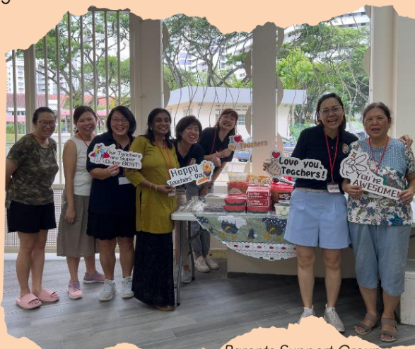
Parents Support Group