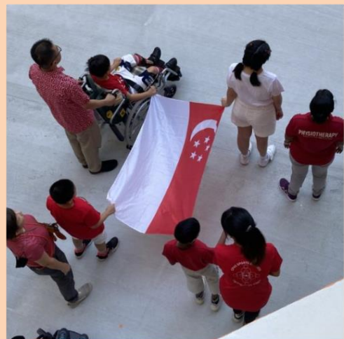
Students bringing in the flag during Observance Ceremony