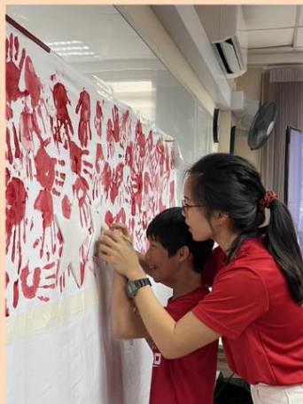
Students playing the "What's missing on the flag" game

Under the open sky, our parade square hosted a meaningful Observance Ceremony. This ceremony set the tone for the celebrations, reminding us that despite our diverse backgrounds, our Singaporean identity unites us.