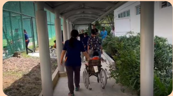
Everyone evacuating to Rulang Primary School in an orderly and safe manner.