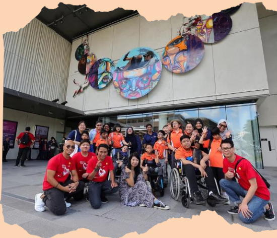
Group photo outside the Singtel Waterfront theatre after a memorable musical experience