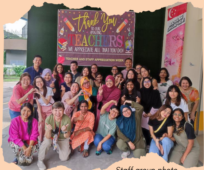
Staff group photo

The school is also extremely grateful for the Parents @ CPAS or P@C (Parents Support Group) who have graciously and generously sponsored food for everyone. They had put in a lot of effort to cook finger food for everyone and they also made an exceptionally refreshing concoction, which everyone loved. The school would like to convey our deepest appreciation for these kind gestures.