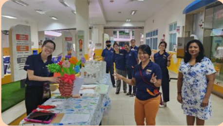
Staff arrived early on 26 June 2023 (Monday), eagerly waiting for students to arrive.