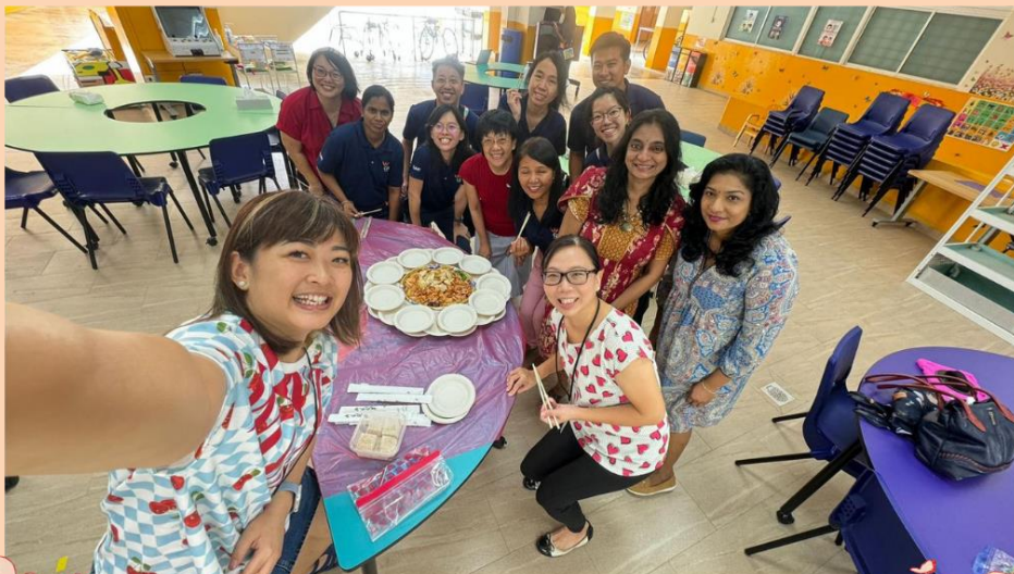
All smiles for Lohei!