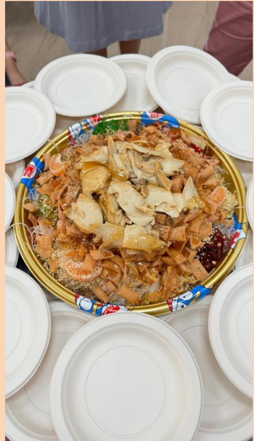
The beautiful Lohei prepared by P@C