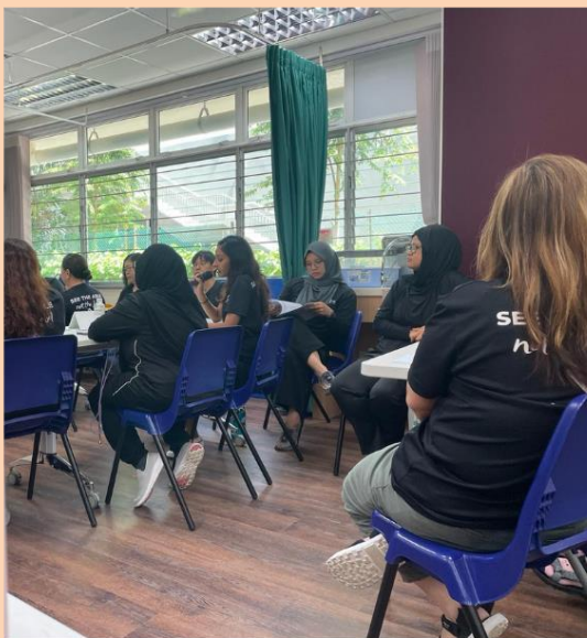
Staff sharing their thoughts on how they would handle negative feedback with a growth mindset.