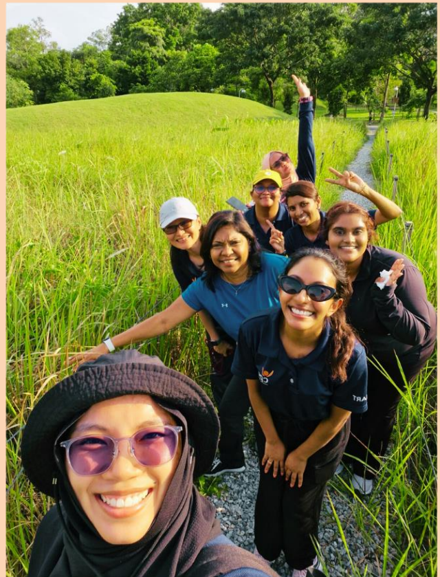
Bright smiles on a sunny afternoon

As the year goes by, we hope this group will grow and more staff can come together to keep fit and at the same time bond.