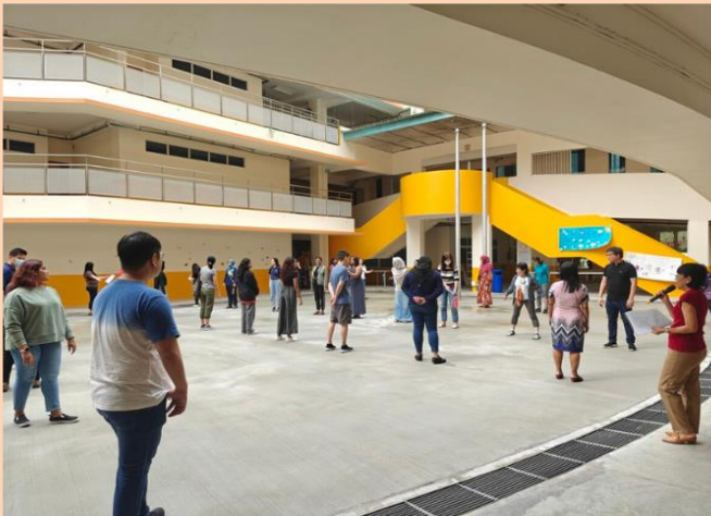
Staff organizing themselves into groups for the Broken Telephone game.

On 29 December 2023 (Friday), Consultant TalentKraft conducted an insightful workshop on the importance of self-evaluation, fostering a culture of continuous improvement within the organization. This session required team members to reflect on their individual strengths and areas for growth, encouraging personal and professional development.