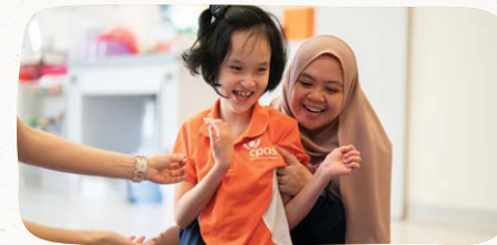
For children between 7 and 18 years old

EIPIIC provides early intervention for children with identified needs between the ages of a few months to six years old. A Trans-Disciplinary Approach is integrated into the curriculum. A multi-disciplinary team collaborates with caregivers to provide holistic education and support to help each child maximise his or her developmental growth.