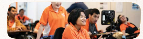
For adults 18 years old and above

DAC provides day care for persons who require higher support. The primary aim is to nurture self-help skills through a balanced and structured curriculum of daily living, social skills training, therapy rehabilitation care and recreational activities.