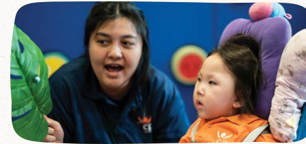
For children up to 6 years old