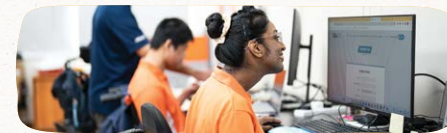
For adults 18 years old and above