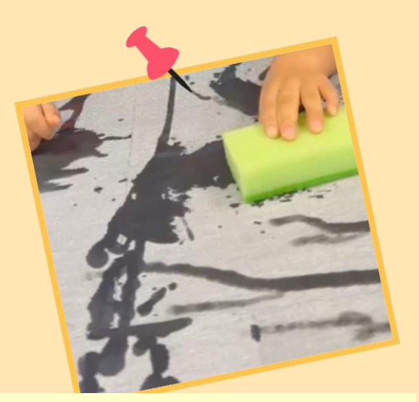
Activity boards from the Mark Making Corner were removable and teachers had the freedom to bring them back to class for students to explore at their own pace.

The Arts Festival served dual purposes, namely creating art and creating connections. Through diverse forms of expression, a space was created for all to explore their own creativity, foster collaboration with one another and make unique contributions. Heartfelt gratitude to members of the HSP Art Domain, Multi-Sensory Drama CCA, Music and Movement CCA, Sensory Stimulation CCA, teachers and students who participated in the event and made it a success.