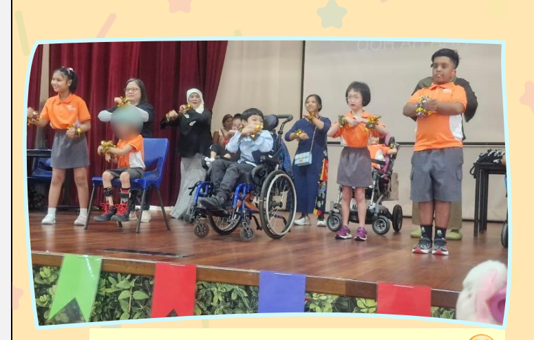
Eagle 5A & Eagle 6A gave a live dance performance

This year's Teachers' Day celebrations ended on a high note, with everyone leaving the school hall beaming with joy and appreciation. The event truly captured the spirit of gratitude and fun, making it a memorable day for all!