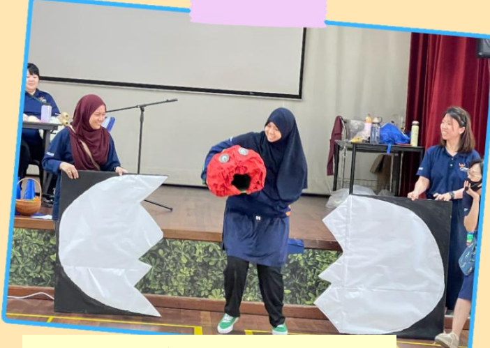
Multi-Sensory Performance on The Very Hungry Caterpillar, brought together by Multi-sensory Drama CCA and Music and Movement CCA.

With the interactive drama performance by the Multisensory Drama CCA and Music and Movement CCA, the lines between audience and performers were blurred as students participated in the story by feeding the caterpillar and using musical instruments to create sound effects. This fostered a sense of collective imagination and connection with the story.