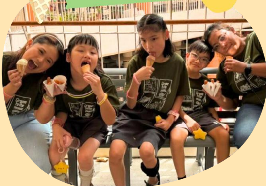
Students and teachers delight in their treats from the free-flow ice cream booth, sharing smiles and sweet moments together.