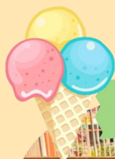
CLASS EAGLE 3B