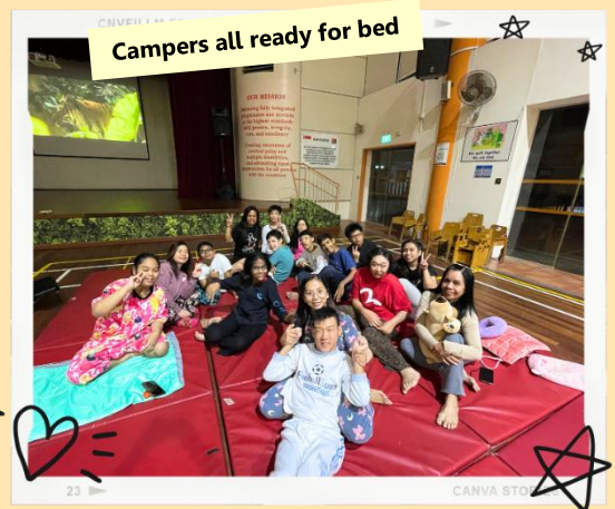
Campers all ready for bed