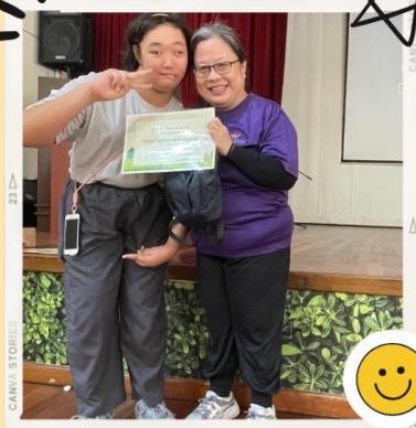
▲ Most Helpful Camper ▲ ◀◀ Best Campers ▶▶