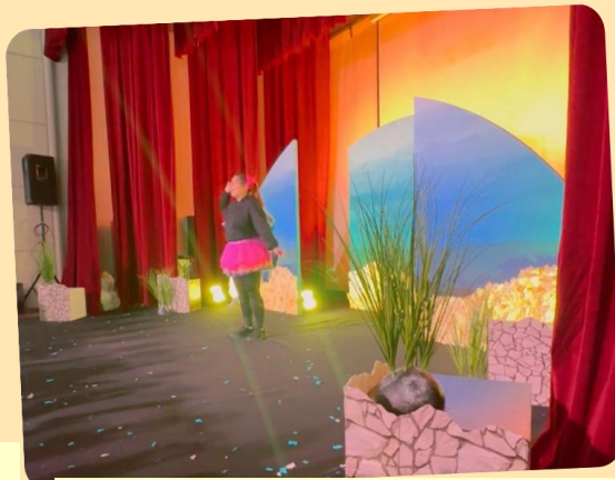
A magical moment from the sensory performance Toby's Journey, held in the school hall, where students experienced an engaging, multi-sensory adventure.