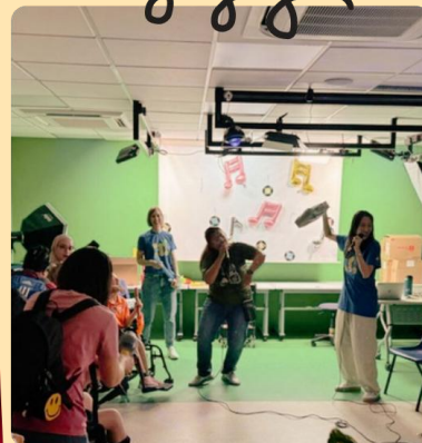
Staff, LEGO volunteers, students, and caregivers enjoying a lively session in the Karaoke Room, singing their hearts out and creating unforgettable memories together.

The Arcade Room became an arena of fun and friendly competition, where students enjoyed musical games like Guitar Freak and Taiko Drums. The room was filled with laughter as students tested their skills on these musical arcade games right in their own school. In the Karaoke Room, a cozy karaoke lounge was set up with speakers and microphones, where students could sing their favourite songs. For our non-verbal students, teachers delighted them by singing their favourite tunes, making the experience inclusive and unforgettable. The Culture Exploration Room introduced students to musical traditions from around the world. Set up with multiple stations, students had the opportunity to learn about different cultural music and instruments, sparking curiosity and appreciation for diverse sounds and rhythms.