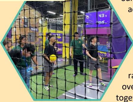
Campers enjoying the activities in SuperPark.

Staff from Macdonald's volunteered for the camp and they accompanied students for an extremely fun time at the SuperPark at Suntec City. Both students and volunteers enjoyed the activities at the SuperPark and everyone had great fun together. After a tiring day at the SuperPark, students were treated to a good lunch and this fueled their energy for the next activity, camp BBQ! Everyone looked forward to the highlight of the camp, and that was the barbeque. What fun the students had, a rare opportunity for the students to cook their own meal, over the grill and under the stars! They enjoyed the time together with their schoolmates and teachers. As night fell, students bathed, in pajamas and hugging their favourite soft toys and pillows, with tired sleepy eyes, all was ready to sleep and rest for the second day.