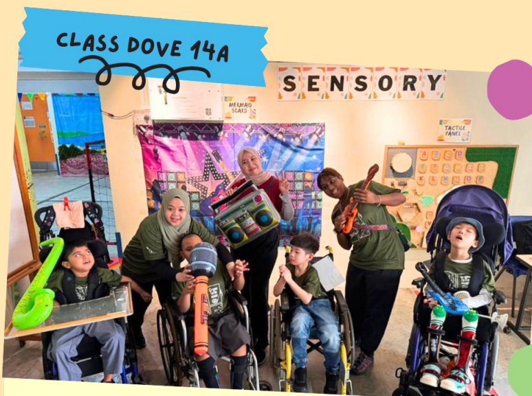
Say cheese! Students and teachers strike a pose with vibrant musical props, capturing a joyful moment from the celebration.