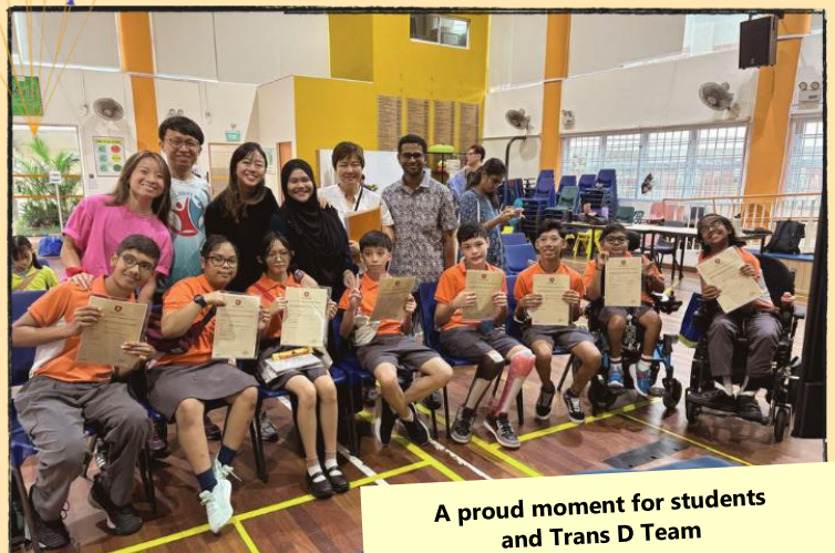
A proud moment for students and Trans D Team