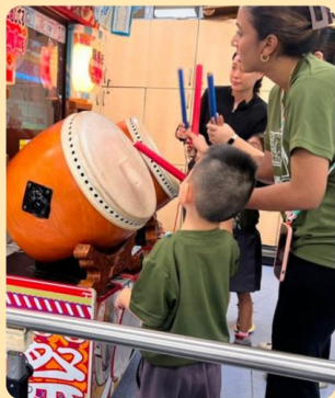
Students enjoying an exciting rhythm challenge on the Taiko Drums in the Arcade Room, creating beats and having fun with this musical arcade experience!

On 3 rd October 2024, CPASS East students across both AM and PM sessions celebrated Children's Day with a vibrant musical theme, "Music & Songs." Thanks to the enthusiastic support of Republic Polytechnic, LEGO, and Loomis volunteers, students were treated to an extraordinary day of laughter, music, and joyful memories. The celebration offered a diverse range of activities designed for a memorable and inclusive experience.