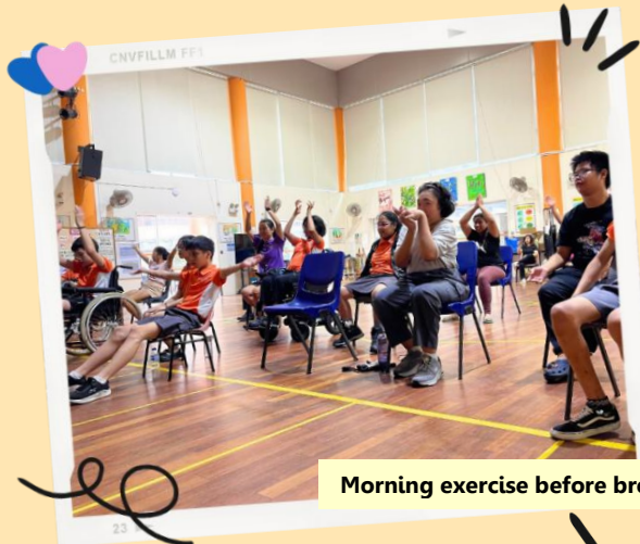
Morning exercise before breakfast