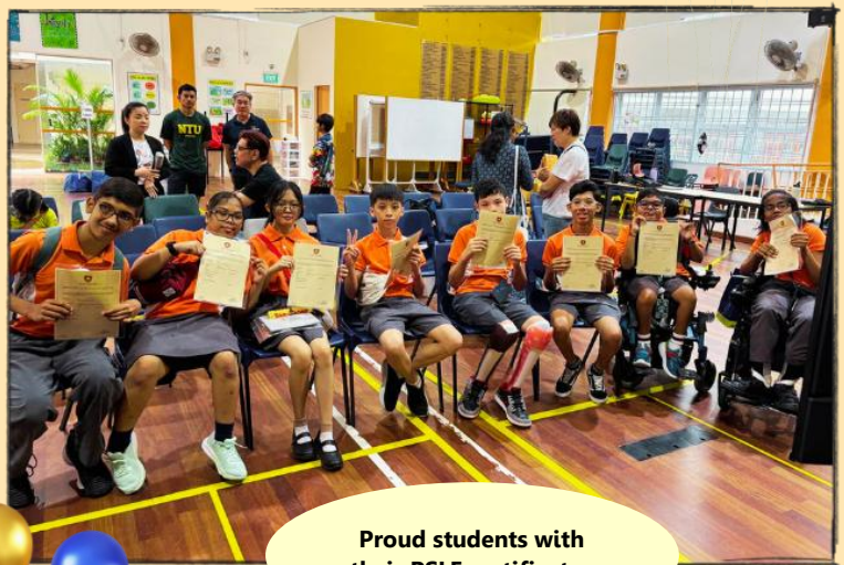
Proud students with their PSLE certificates