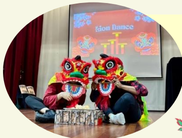
A Roaring Start with Lion Dance and Chai Shen (God of Fortune)

This year's Chinese New Year celebration was filled with joy, excitement, and meaningful moments for our students, staff, and caregivers. The theme for this year was costumes. Our celebration kicked off with a spectacular lion dance performance by none other than our very own teachers! The energy and enthusiasm they brought to the stage were infectious, filling the hall with festive spirit. Adding to the excitement, our very own Chai Shen (God of Fortune) made a grand entrance, accompanied by teachers playing the Chinese drums, symbolizing good luck and prosperity. Students eagerly reached out to receive their blessings, setting a joyous tone for the rest of the event.