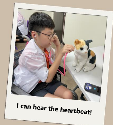
I can hear the heartbeat!