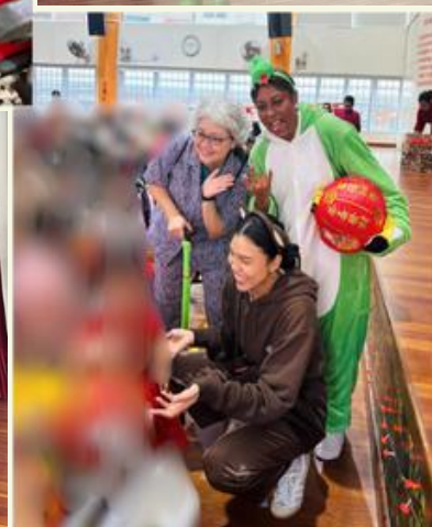
A Journey of Wisdom: The Snake's Wise Journey