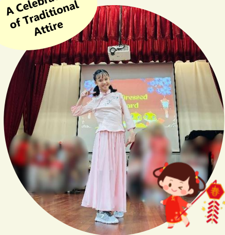
A Celebration of Traditional Attire

To wrap up the celebration, we held the Best Dressed Awards, recognizing students and staff who embraced the festive spirit through their creative outfits. This was followed by a heartwarming sing-along session, where everyone joined in to belt out classic Chinese New Year songs. The event ended on a sweet note with the distribution of mandarin oranges, symbolizing good luck and blessings, to all students, staff, and caregivers. It was truly a celebration to remember, and we look forward to more joyous moments together in the coming year!