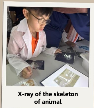
X-ray of the skeleton of animal