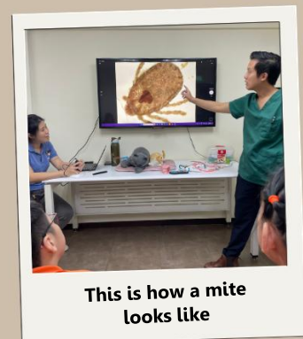
This is how a mite looks like