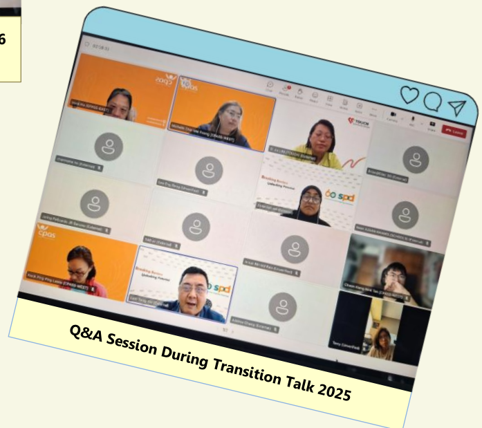
Q&A Session During Transition Talk 2025