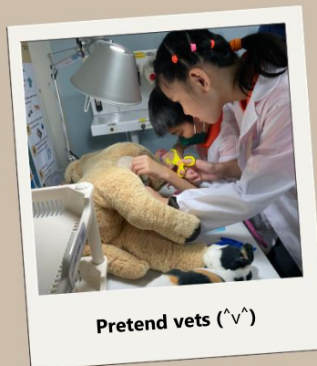
Pretend vets (^~^)