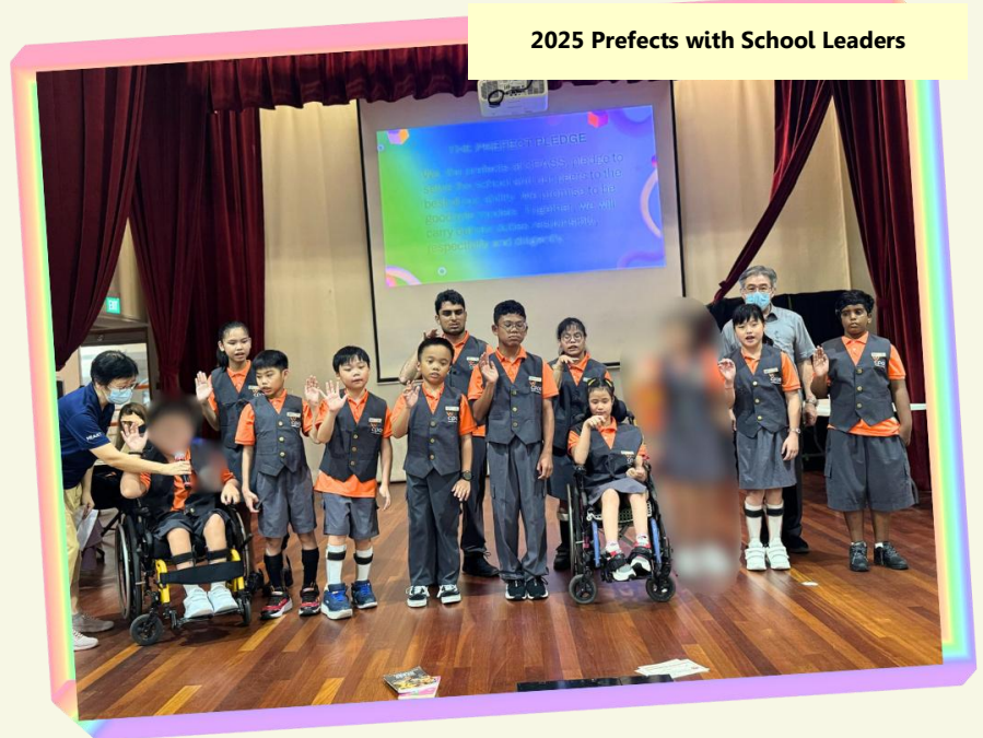
2025 Prefects with School Leaders