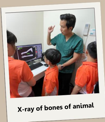
X-ray of bones of animal

By the end of the day, we felt satisfied, having learnt so much about cats, dogs, and the world of veterinary care!