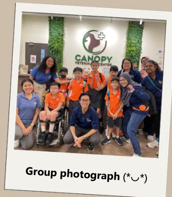
Group photograph (*~*)