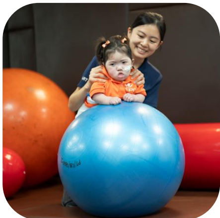
Early Intervention Programme for Infants and Children (EIPIC) For children below 6 years old