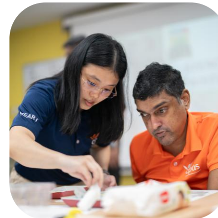
Adult Services (GROW / DAC) For adults aged 18 years old & above