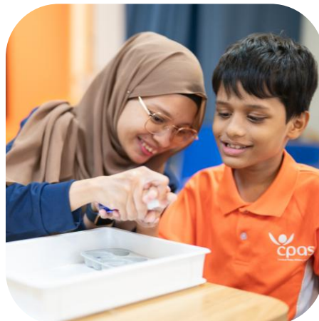
Special Education (SPED) School For children aged 7 to 18 years old