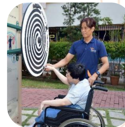
Home Management Programme