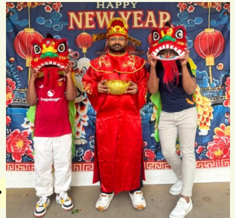
Chai Shen (centre) and his side-kick dragons

The morning began with the energetic beats of a lion dance , instantly filling the hall with festive spirit. This was followed by a special appearance by Chai Shen (God of Fortune) , who paraded around the hall tossing coins and spreading wishes of prosperity and good luck to students and staff.