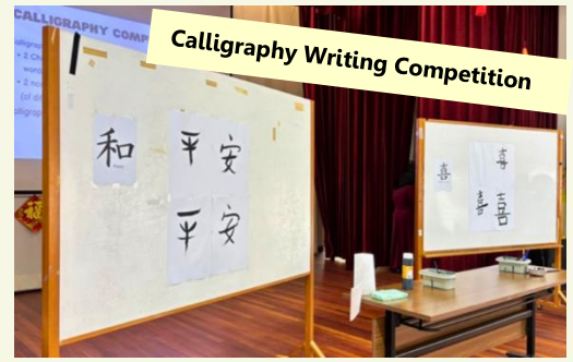
Calligraphy Writing Competition

It was a morning full of smiles, creativity and festive spirit, a wonderful way for the CPASS East community to learn and celebrate together.