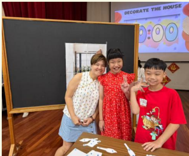
Smiles + Creativity + Festive Spirit = A Joyful and Prosperous Lunar New Year!