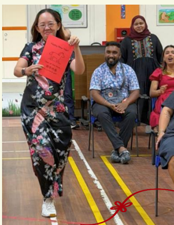
Welcoming in the Year of the Horse in 2026.