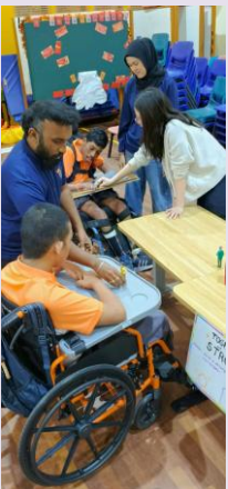
Class 8A enjoying the activity at the Psychological Defence Booth.