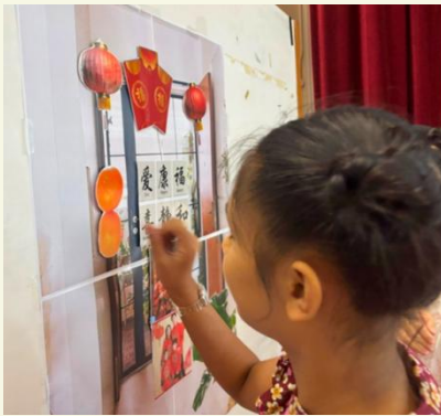
Students admiring displays for the Decorate a CNY House Competition.