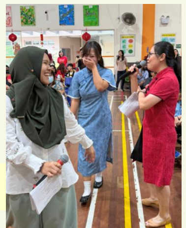
And the best dressed goes to ... don't be shy!

The celebration continued as students learned about Chinese New Year outfits and visiting traditions , discovering how families celebrate and spend time with loved ones during the festive season.