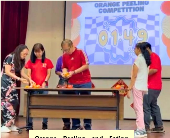
Orange Peeling and Eating Competition – fastest fingers and mouth wins! 😊

One of the loudest and funniest moments of the day came when teachers took center stage for the Orange Peeling and Eating Competition . The hall erupted with cheers and laughter as students enthusiastically supported their teachers in this playful and symbolic activity representing good luck and prosperity.