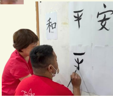
Chinese calligraphy is hard work!

To round off the celebration, students were introduced to Chinese calligraphy and watched their teachers bravely take on the Calligraphy Writing Competition , ending the event on a joyful and memorable note.